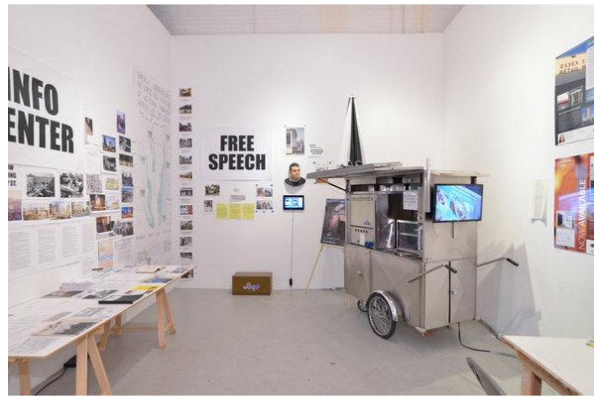
Inside Cuchifritos Gallery

This unique endeavor offers gallery space to hundreds of independent curators inside the Essex Street Market. The recent exhibit "Nom Nom Ohm: When Life Gives You Lemons, Make Chandeliers" featured two ornate chandeliers: one hung high, with lemons dangling majestically from its arms, and another low, with electrical wires leading down to a scattered group of root vegetables. Another thought-provoking exhibit, "On the Subversion of Opacity," drew on a quote by noted novelist Italo Calvino to create a site-specific installation that explored reality as a fictional myth.