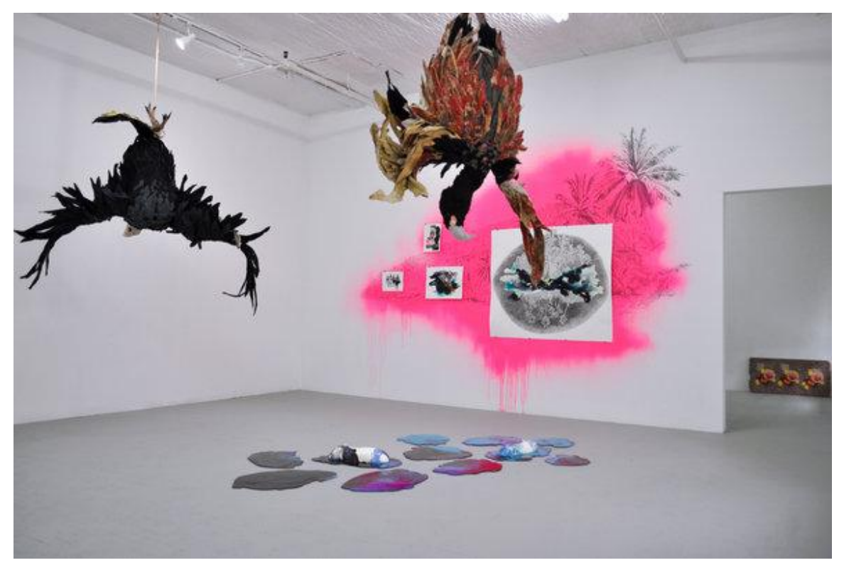
Inside Y Gallery

Y aims to spark a dialogue among a wide range of communities with striking exhibits like Irving Morazan's "Xolo Yawning," named after the only dog indigenous to the Americas. The solo exhibition explores the author's Mayan heritage, with intricately imagined bronze sculptures, each expressing a multitude of ideas at war with themselves. Most arresting is a castle with a shark bursting out of one end and a dragon roaring through the other.