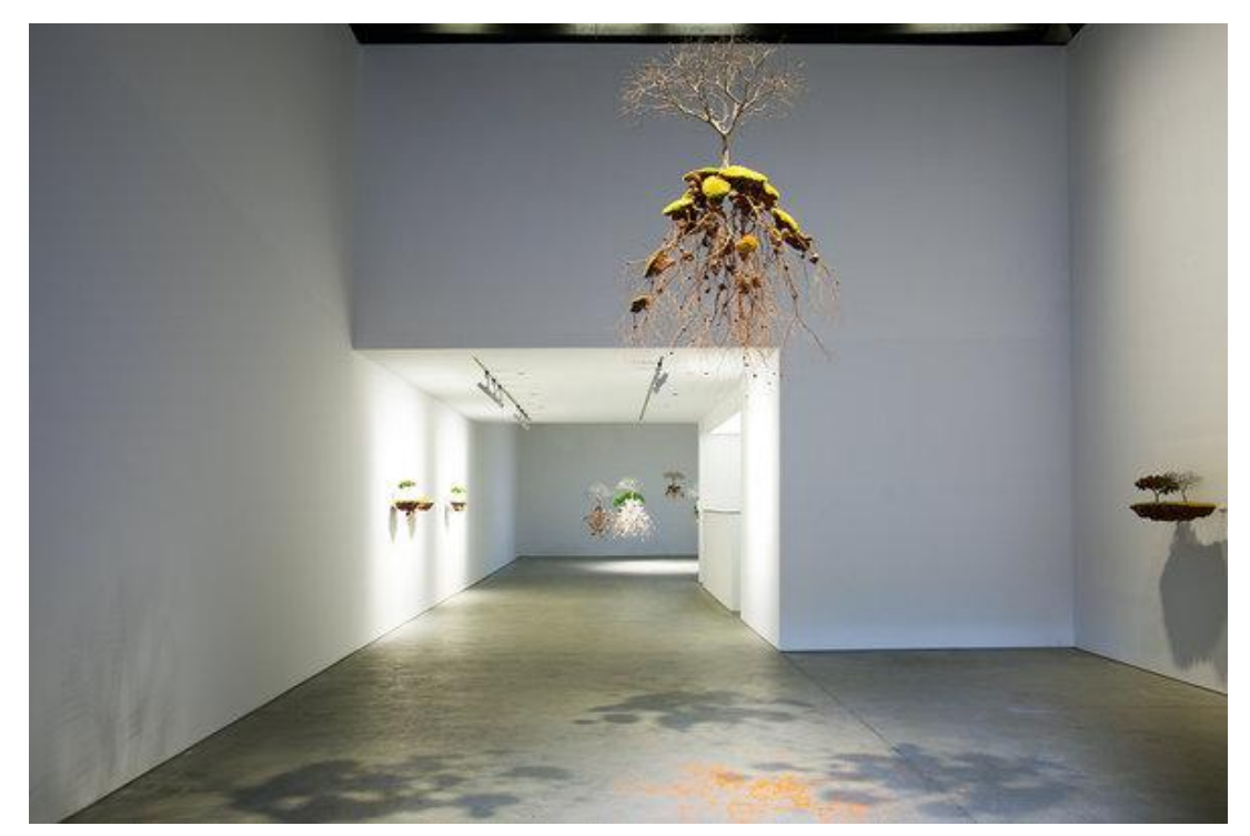
Inside Richard Taittinger Gallery