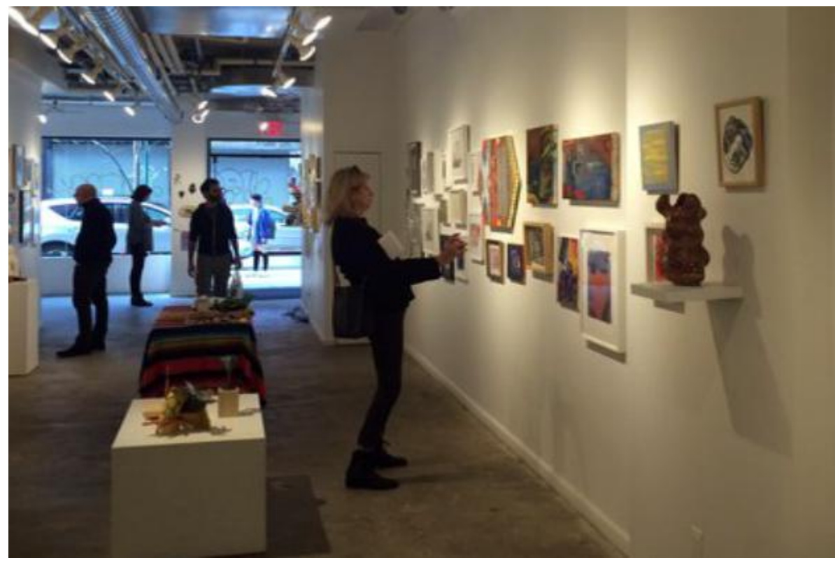
Inside Lesley Heller Gallery

This contemporary gallery is interested in creating a cross-generational conversation among artists, critics, curators and collectors, while also engaging the general public with a series of lectures, poetry readings and live performances. The exhibitions themselves explode with a sense of vibrant urgency. A recent exhibit of video art, "A Room Behind a Room," featured a chunk of earth being propelled through the sky.