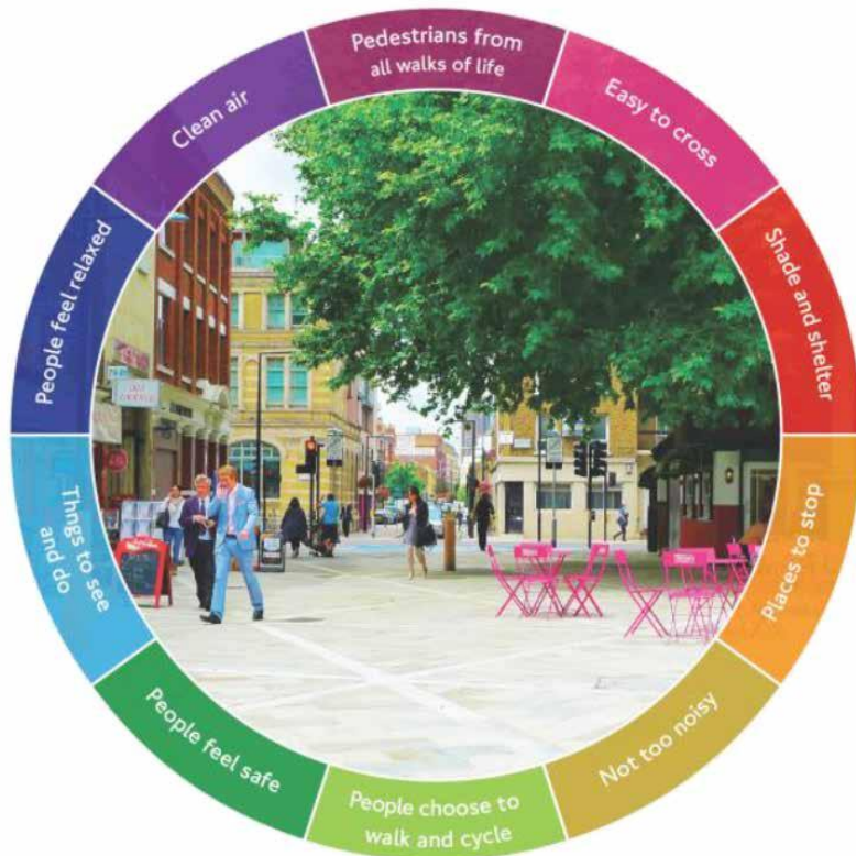
Transport for London's Healthy Streets Indicators