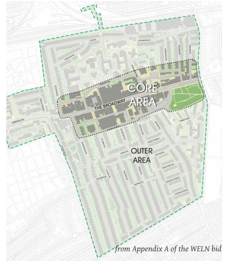
from Appendix A of the WELN bid

There has been concern for a long time that West Ealing has become the poor relation of Ealing's main centre further along the Uxbridge Road. The council applied for money to improve it and was awarded £6.5 million by Transport for London as part of the 'Liveable Neighbourhood' scheme. Many local organisations, ECC among them, publicised the matter and solicited input from members of the public.