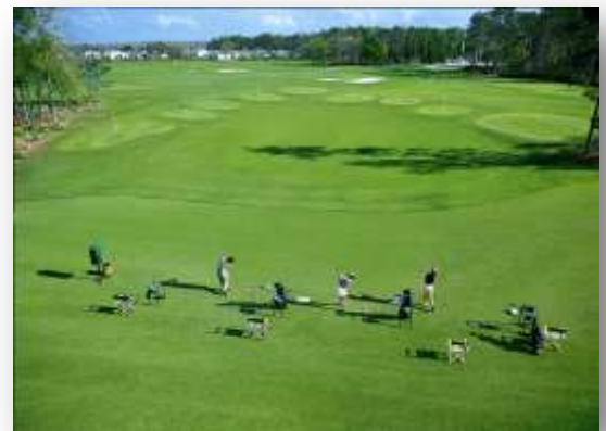
Faldo Golf Institute at Marriott 9-green wedge practice ground