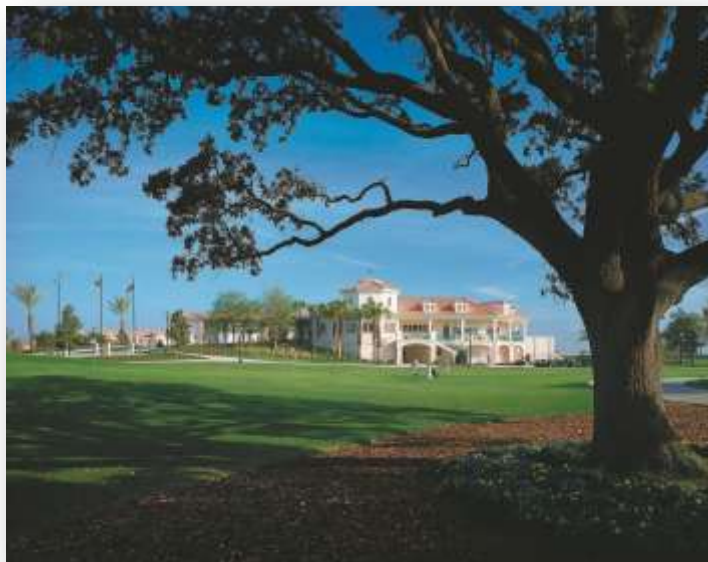
Clubhouse, Marriott Grande Vista Golf Club

Our school will feature 1 ½ days indoor lecture and demonstration and ½ day on the practice range. We have also arranged a private room for dinner at Maggianno's for students who would like to join us.