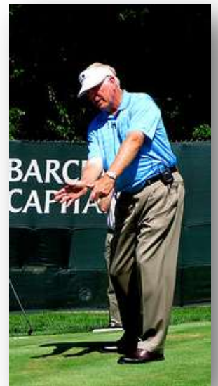
Teaching private clients at The Barclays