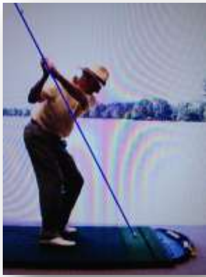
In the teaching bay