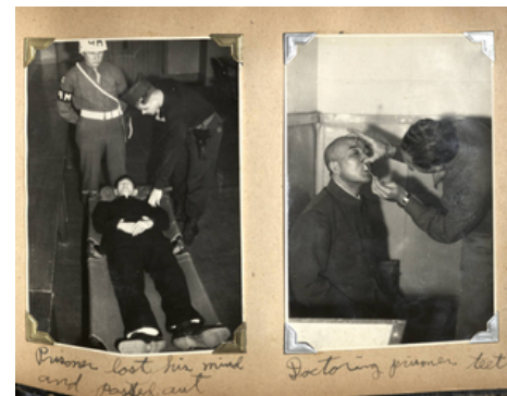
Prisoner lost his mind and passed out

Photograph #14: Shūmei Ōkawa, one of the defendants on trial, lying on a stretcher with two military personnel standing over him. He was a Japanese nationalist and Pan-Asianist writer. Ōkawa was later declared mentally unfit to stand trial.