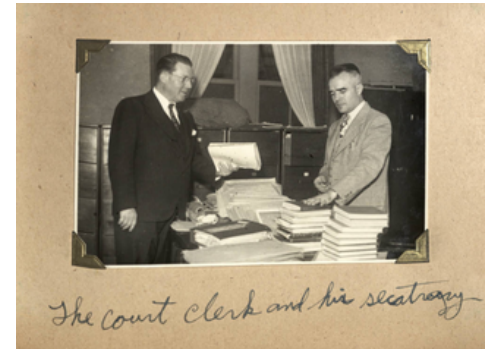
The Court Clerk and his secretary