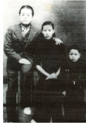
Photograph #6: The Woo boys with their school friends in Louisville, KY circa 1951.