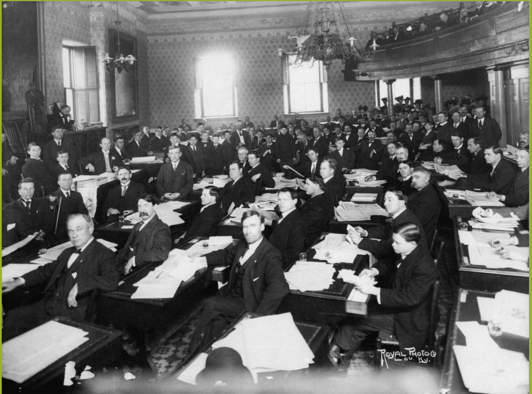
Photograph Courtesy of the Kentucky Historical Society ( SC1970_1 )