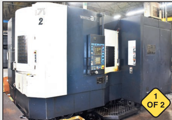
Makino A71 CNC Horizontal Machining Center