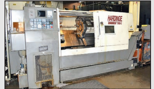
Hardinge Conquest T-65L CNC Turning Center

CNC LATHES: Incl. Hardinge Conquest T-65L; (2) Southwestern Trak TRL1745