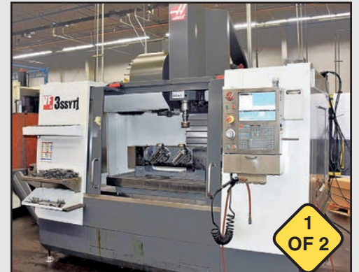
Haas VF3SSYT CNC Vertical Machining Centers

(25) CNC HORIZONTAL MACHINING CENTERS: Incl. Makino Mds. A61NX, A51, A71, A81; Mori Seiki Mds. NHX4000, NH5000, SH-500, SH-633, SH-403; OKK Mdl. HM-80S, Toyoda Mdl. FA1050