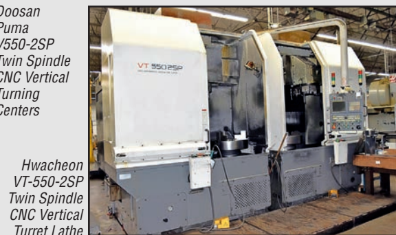
Hwacheon VT-550-2SP Twin Spindle CNC Vertical Turret Lathe