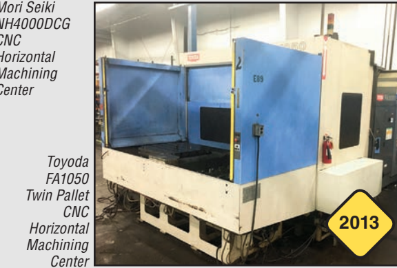
Toyota FA1050 Twin Pallet CNC Horizontal Machining Center