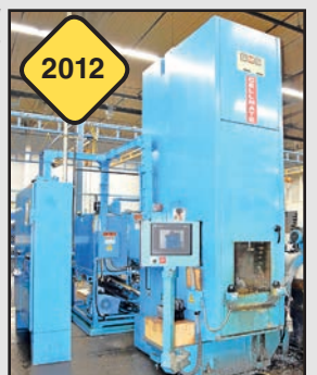
VERTICAL HYDRAULIC BROACHING MACHINE: Broaching Machine Specialties Mdl. Cell-Mate BMCM-1554 15-Ton X 54", S/N: 1762-12 (2012)

Can't attend this auction? Bid online at