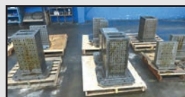
Miscellaneous Shop Support