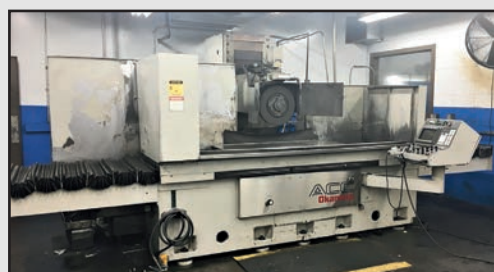
Okamoto ACC-2860EX CNC Surface Grinder

(5) CNC SCREW MACHINES: Incl. (3) Star SV-32JII, (2) Schutte SG-18