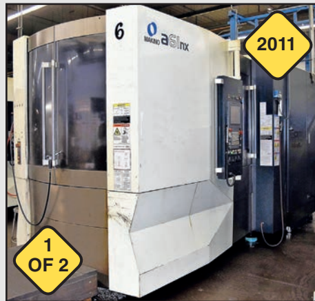
Makino A61NX CNC Horizontal Machining Centers