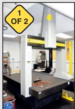
Brown & Sharpe 12-20-10-SP Coordinate Measuring Machine

(7) CMM'S: Incl. Brown & Sharpe Mds. 12-20-10SP, XCEL 9-15-9, Global, XCEL 7-10-5, XCEL PFX4-5-4, Etc.