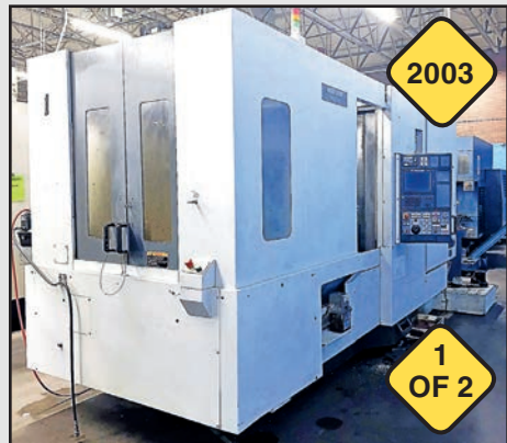
Mori Seiki NH5000/40 CNC Twin Pallet Horizontal Machining Center