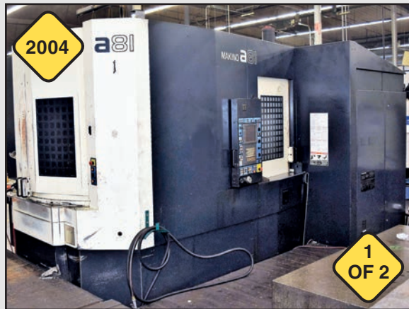
Makino A81 CNC Horizontal Machining Centers