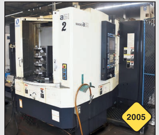
Makino A51 CNC Horizontal Machining Center