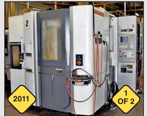
Mori Seiki NHX4000 CNC Horizontal Machining Centers