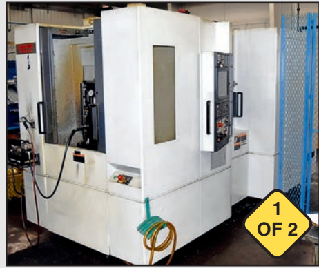
Mori Seiki NH4000DCG CNC Horizontal Machining Center