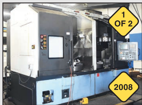
Doosan Puma V550-2SP Twin Spindle CNC Vertical Turning Centers

(3) CNC VERTICAL TURNING CENTERS: Incl. (2) Doosan Puma V550-2SP; Hwacheon VT-550-2SP