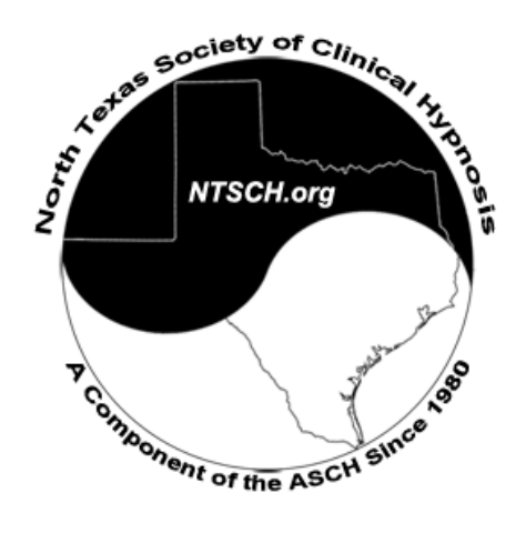
Address City, State zip Phone