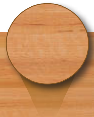
Appalachian Red Oak