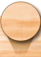
Northern Hard Rock Maple

The Boos® Extra 1" Edge: All Boos® counter tops in standard lengths of 8' or longer are manufactured with 1" added to the length. This is another exclusive Boos® bonus offering for fabricating a long block into two shorter blocks, allowing room for the saw cut, yet maintaining the full length of both block requirements.