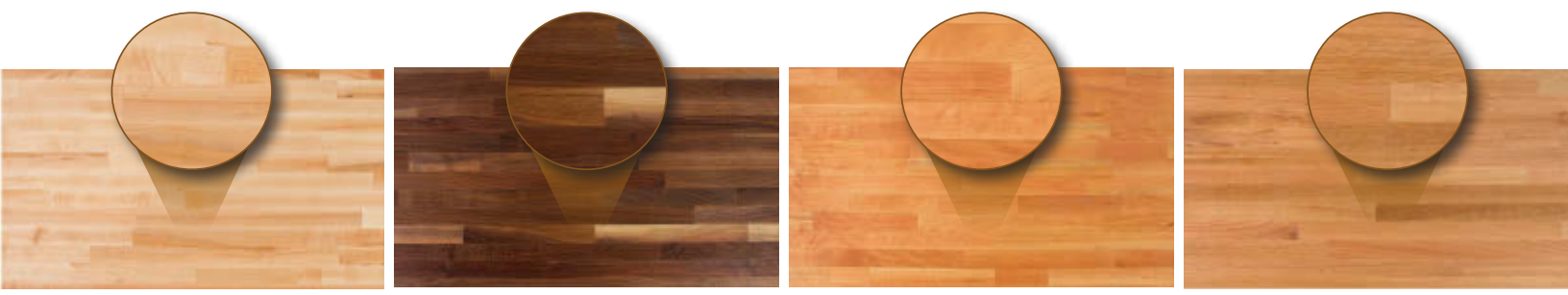
Northern Hard Rock Maple

The Boos® Extra 1" Edge: All Boos® counter tops in standard lengths of 8' or longer are manufactured with 1" added to the length. This is another exclusive Boos® bonus offering for fabricating a long block into two shorter blocks, allowing room for the saw cut, yet maintaining the full length of both block requirements.