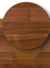
American Black Walnut (Standard 2-3 finger joint per interior rail on 8' or longer Walnut KCT.)