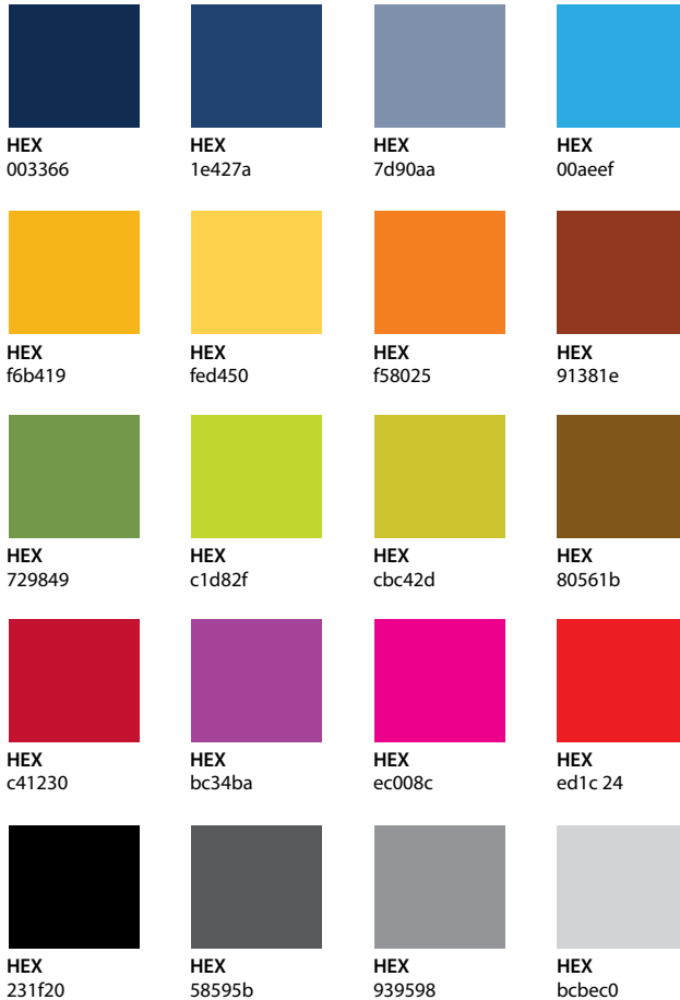
Key Club color palette

Download the complete Key Club Brand Guide at keyclub.org/brandguide .