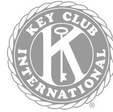
Key Club seal