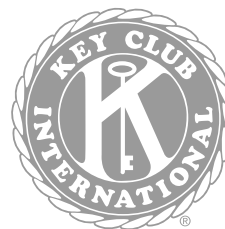
Key Club seal