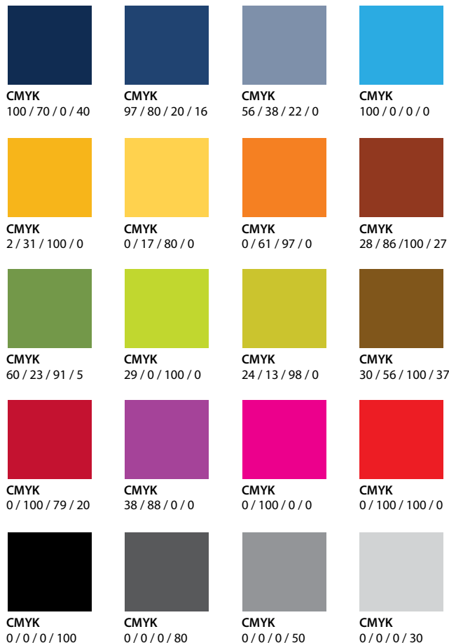
Key Club color palette

You'll reference the brand guide many times as you create your newsletters, shirts, flyers and other pieces. In the brand guides, you'll find the official Key Club colors, fonts and styles to use to maintain the brand. To view the complete brand guide, visit keyclub.org/brandguide .