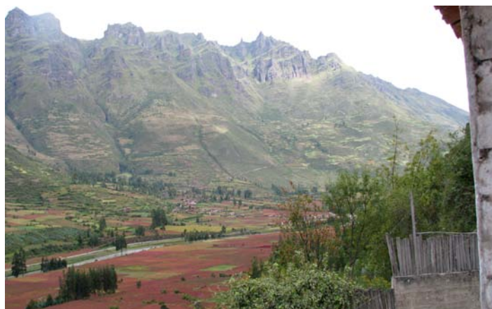
View from my “sweet spot” in Peru

I did not make the shift from being a successful psychotherapist with a thriving private practice to working with entrepreneurs who want to make a difference overnight. The seeds of something new were planted in a powerful vision I had while living in the Peruvian Andes in 2005.