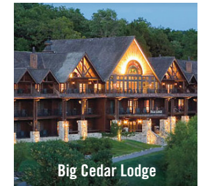
Big Cedar Lodge

To learn more about Kanakuk Transportation options or our Airport Shuttle Service, visit www.kanakuk.com/transportation