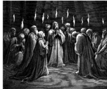
120 NATSARIM RECEIVING THE POWER OF YAHUSHA'S SPIRIT, HE INSCRIBED HIS TORAH IN THEIR HEARTS

YOM TERUAH (DAY OF SHOUT) - WE HEAR A SHOFAR BLOWN, SHADOW OF THE LAST TRUMP: THE COMING DAY OF THE RESURRECTION OF THE DEAD WHEN THE VOICE OF A GREAT MESSENGER WILL SHOUT LIKE A TRUMPET. THIS IS THE FINAL WARNING OF THE COMING HARVEST OF THE EARTH BY THE REAPERS DESCRIBED AT Yual 2, Mt. 24, YashaYahu 24, and Psalm 91.