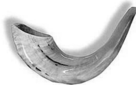
SHOFAR (RAM'S HORN)

THE GIVING OF THE TORAH AT SINAI EXPLAINS ACTS 2. FIRE (SHEKINAH) FELL UPON THE OBEDIENT NATSARIM.