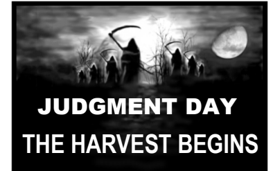
ORDER THE BOOK: REAPERS

Because they don't recognize the "sign of Yunah" they consistently calculate the count to Shabuoth from Abib 16, rather than the Shabath of the week during Matsah. The last page here discusses this. This year it happens to be correct as the 16th of Abib coincides with the way First-fruits is directed. This is the one blind-spot our older brother has, and Yahusha drew our attention to it by calling it "the sign of Yunah."