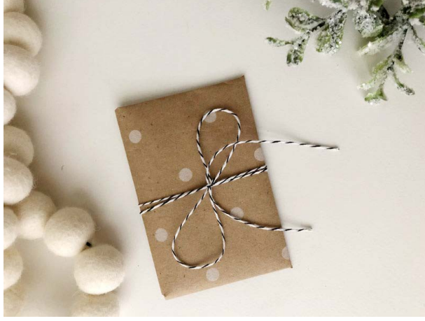
tie with a bow