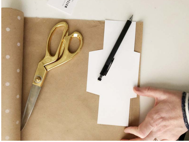
trace pattern onto paper