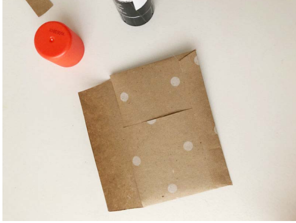
fold up bottom and glue