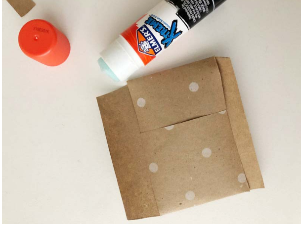
fold in sides and glue