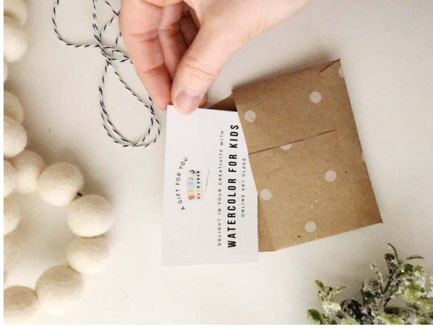
insert gift certificate