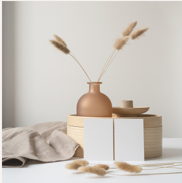
Post Title Two