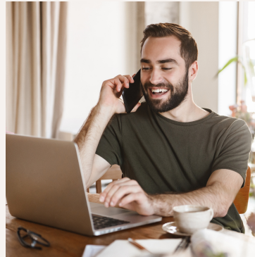
Post Title Three

The world connects through the internet, and social media networks are present in the lives of millions around the world. Social media is becoming one of the most important aspects of digital marketing which provides incredible benefits by reaching millions of customers worldwide. They help you to connect with the customers, increase your brand awareness, and boost your leads and sales.