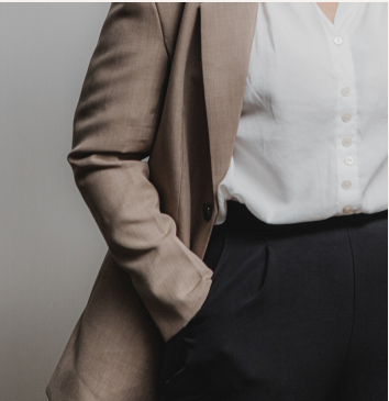
Post Title One