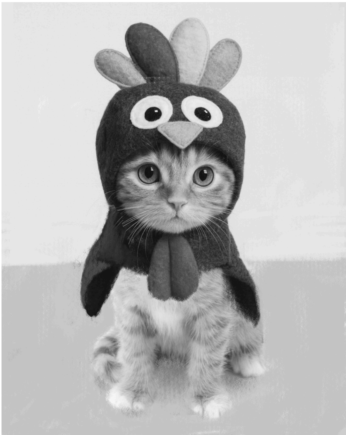
Tur-kitty Day Grayscale