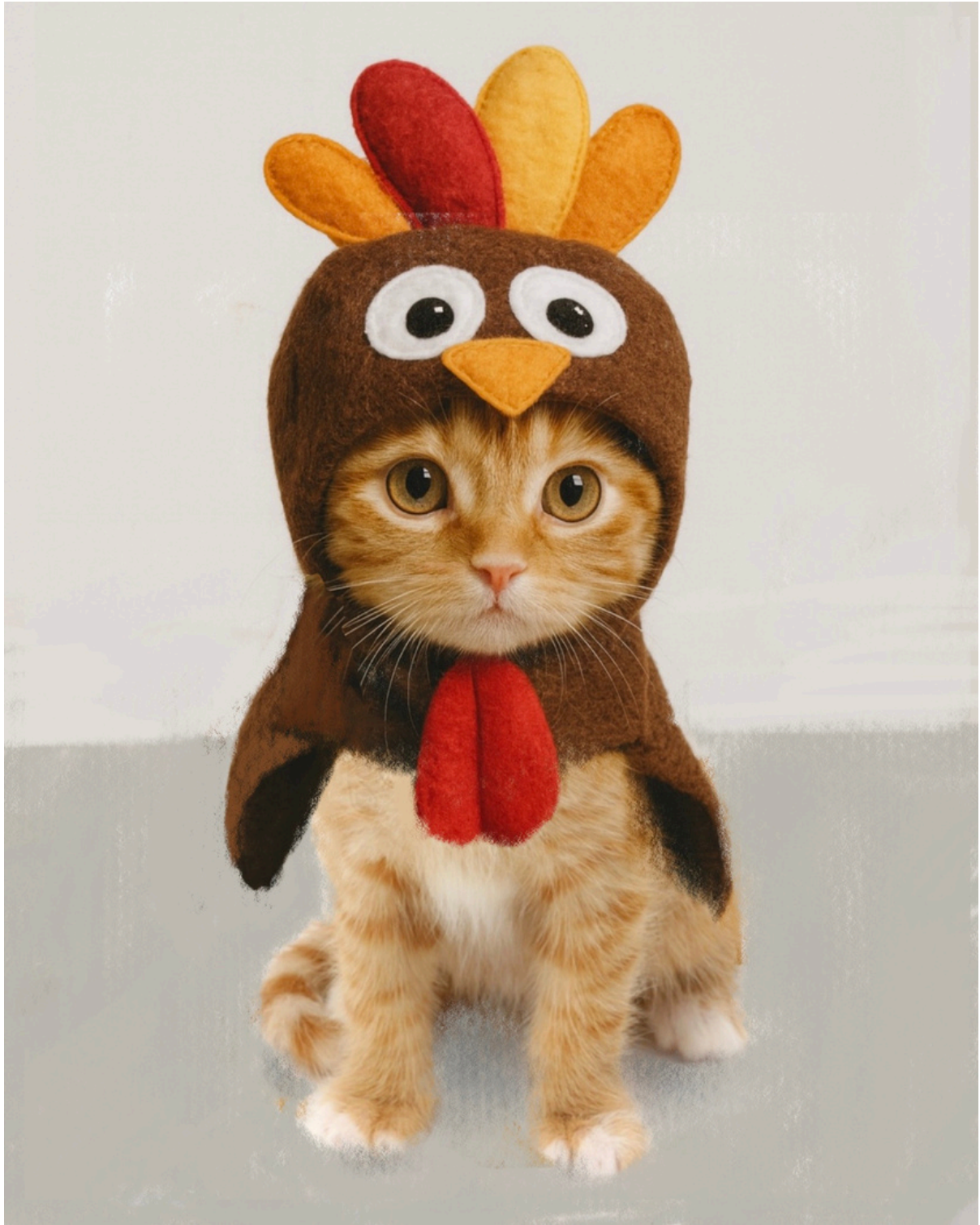
Tur-kitty Day Reference Photo