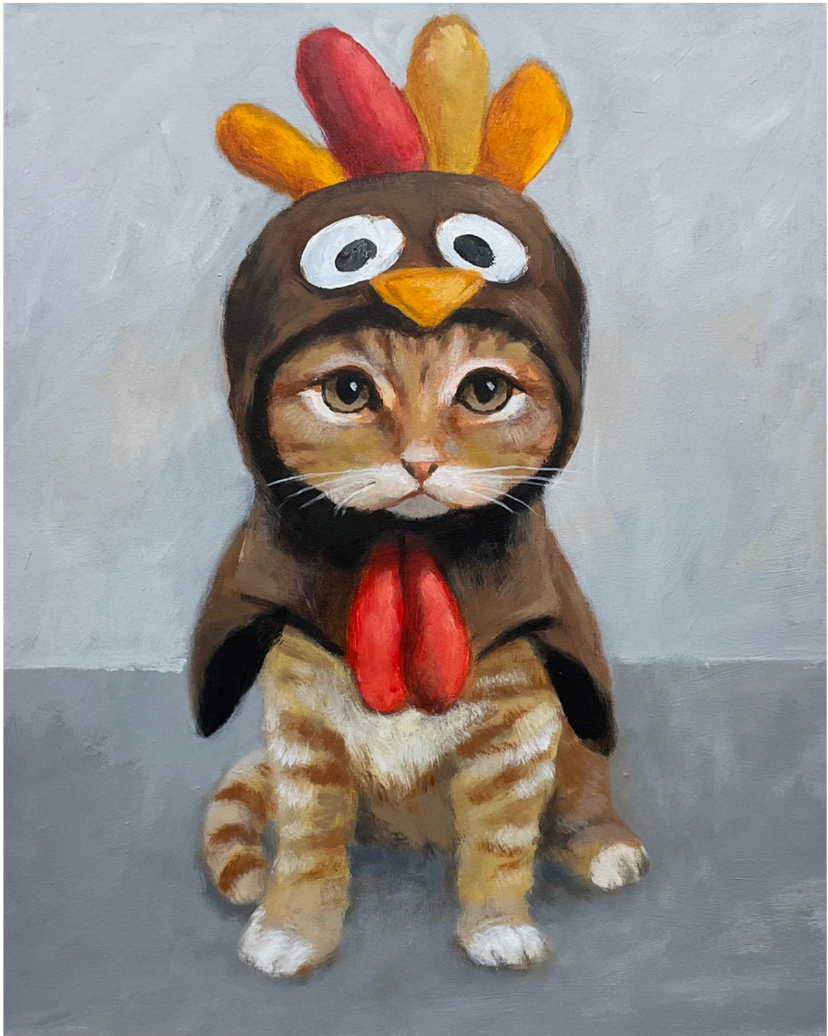
Tur-kitty Day Reference Painting by Bruce