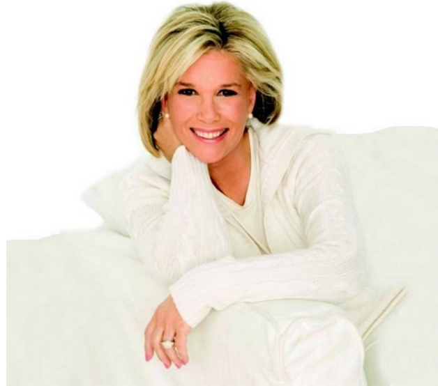
SURVIVOR: Former 'Good Morning America' host and author Joan Lunden talks about her personal breast cancer journey as keynote speaker for the 32nd annual Miami Breast Cancer Meeting Feb. 26-March 1 at Fontainebleau Miami Beach.

02/23/2015 7:00 AM | Updated: 02/23/2015 9:22 PM