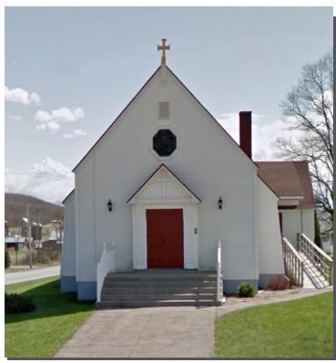
St Bernadette Church