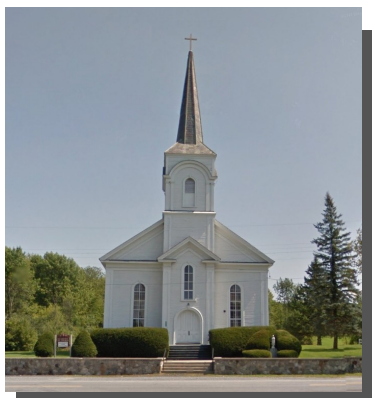
St Genevieve Church