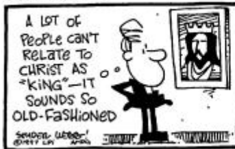
CHRIST THE KING