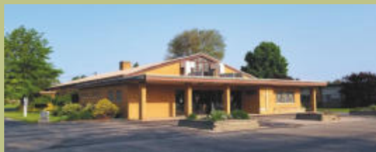
Holy Innocents- St. Barnabas

EXCERPTS FROM THE LECTIONARY FOR MASS #2001, 1998, 1970 CCD, 3/LP1