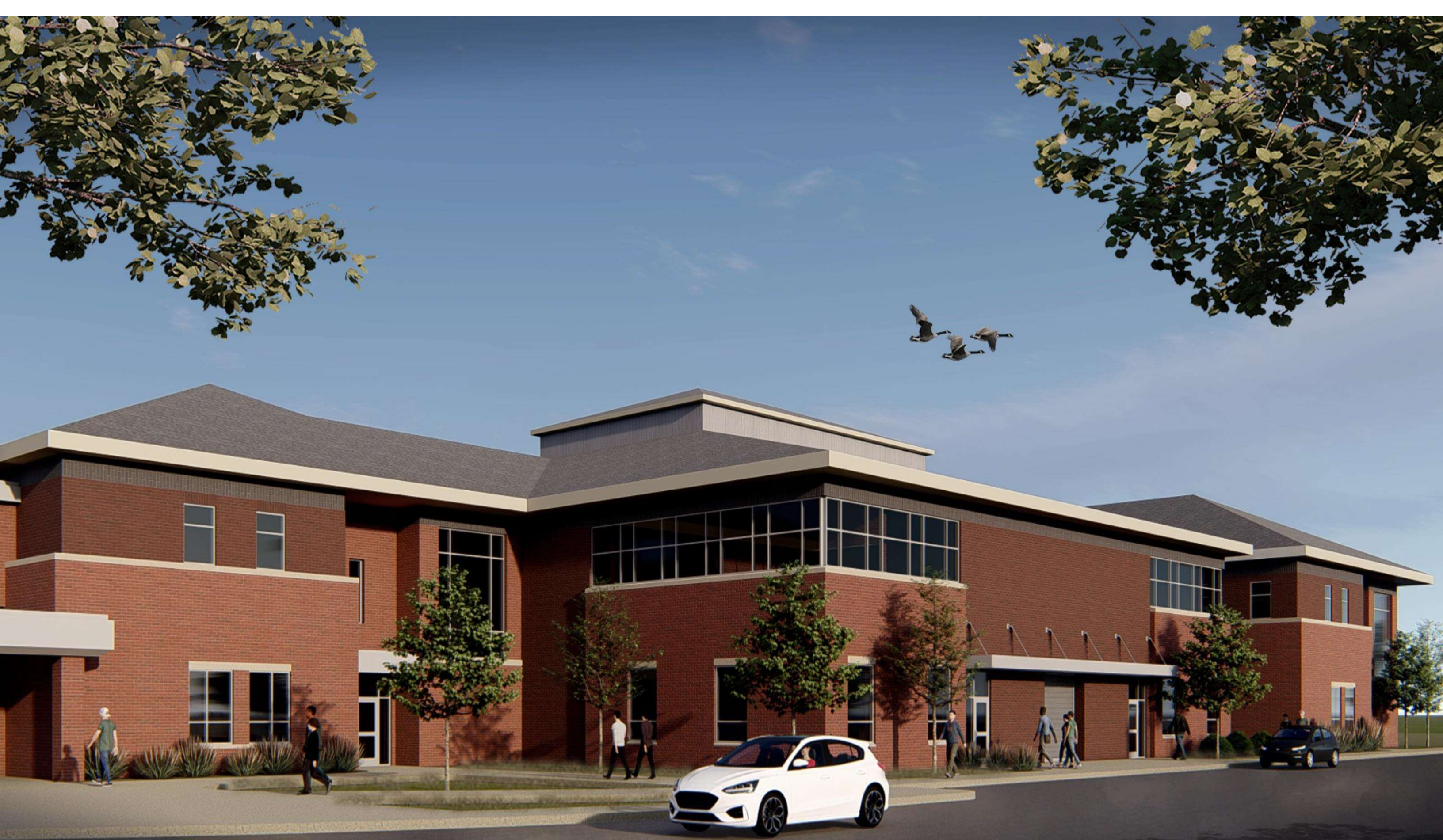
PLTW/Science Expansion (Between G & H Wings)