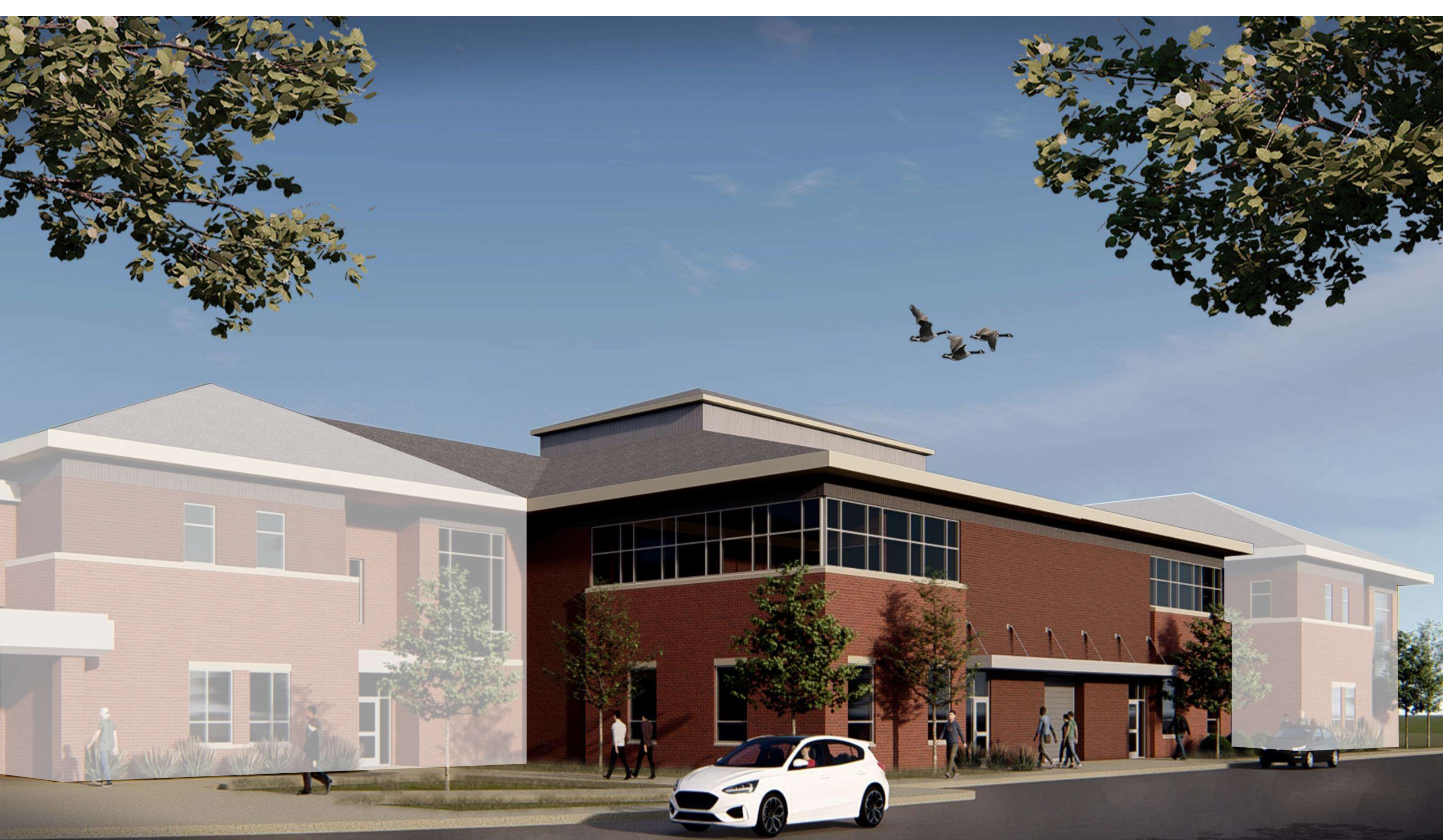
PLTW/Science Expansion (Between G & H Wings)