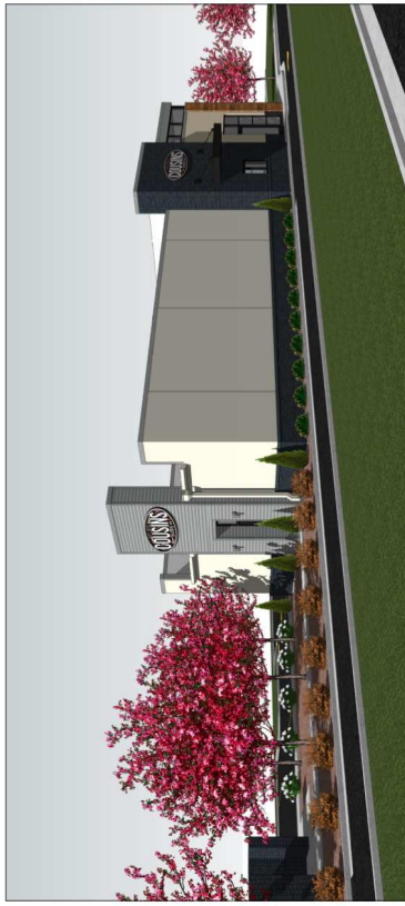
ARCHITECTURAL RENDERING - NORTHEAST VIEW 3