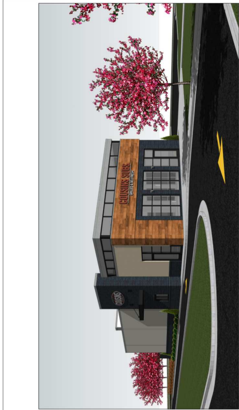
ARCHITECTURAL RENDERING - NORTHWEST VIEW 2