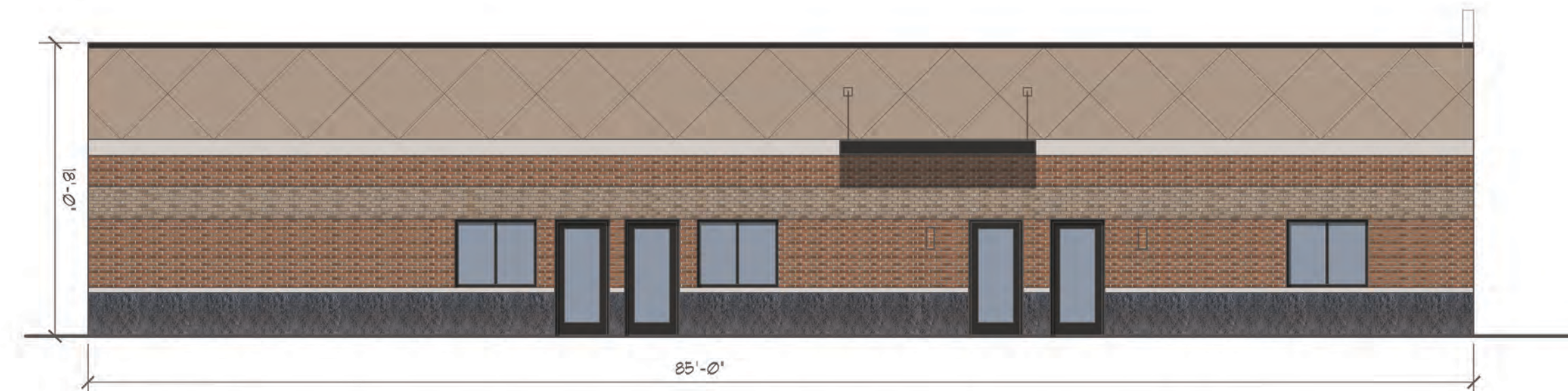
EAST ELEVATION (PLAYGROUND FACING) SCALE: 1/8"=1'-0" OVERALL: 1530SF WINDOWS/DOORS: 158SF MASONRY: 869 SF (63%) EIFS: 475SF (35%) OTHER(METAL ACCENT): 28SF (2%)

petersonARCHITECTURE 298 South 10th Street Suite 500 Noblesville, IN 46060 p 317.770.9714 f 317.770.9718 petersonarchitecture.com