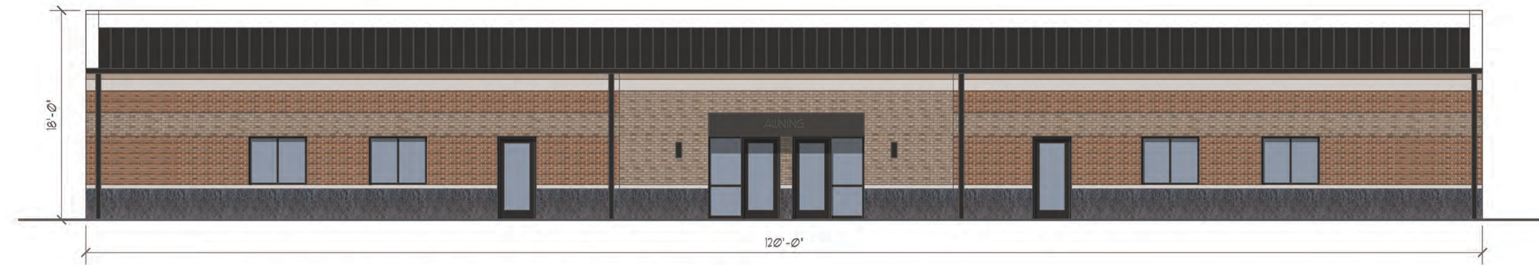
SOUTH ELEVATION SCALE: 1/8"=1'-0" OVERALL: 1560SF WINDOWS/DOORS: 219SF MASONRY: 1271 SF (95%) EIFS: 0SF (0%) OTHER(METAL ACCENT): 70SF (5%)