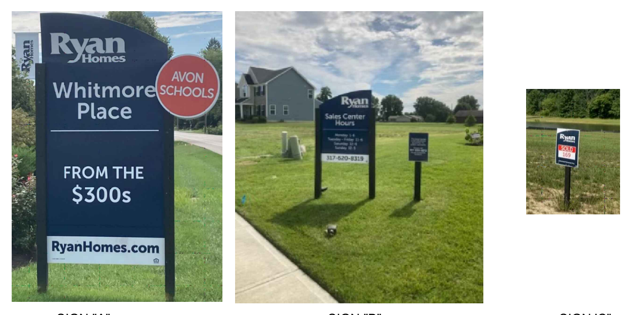
SIGN "A" SIGN "B" SIGN "C"