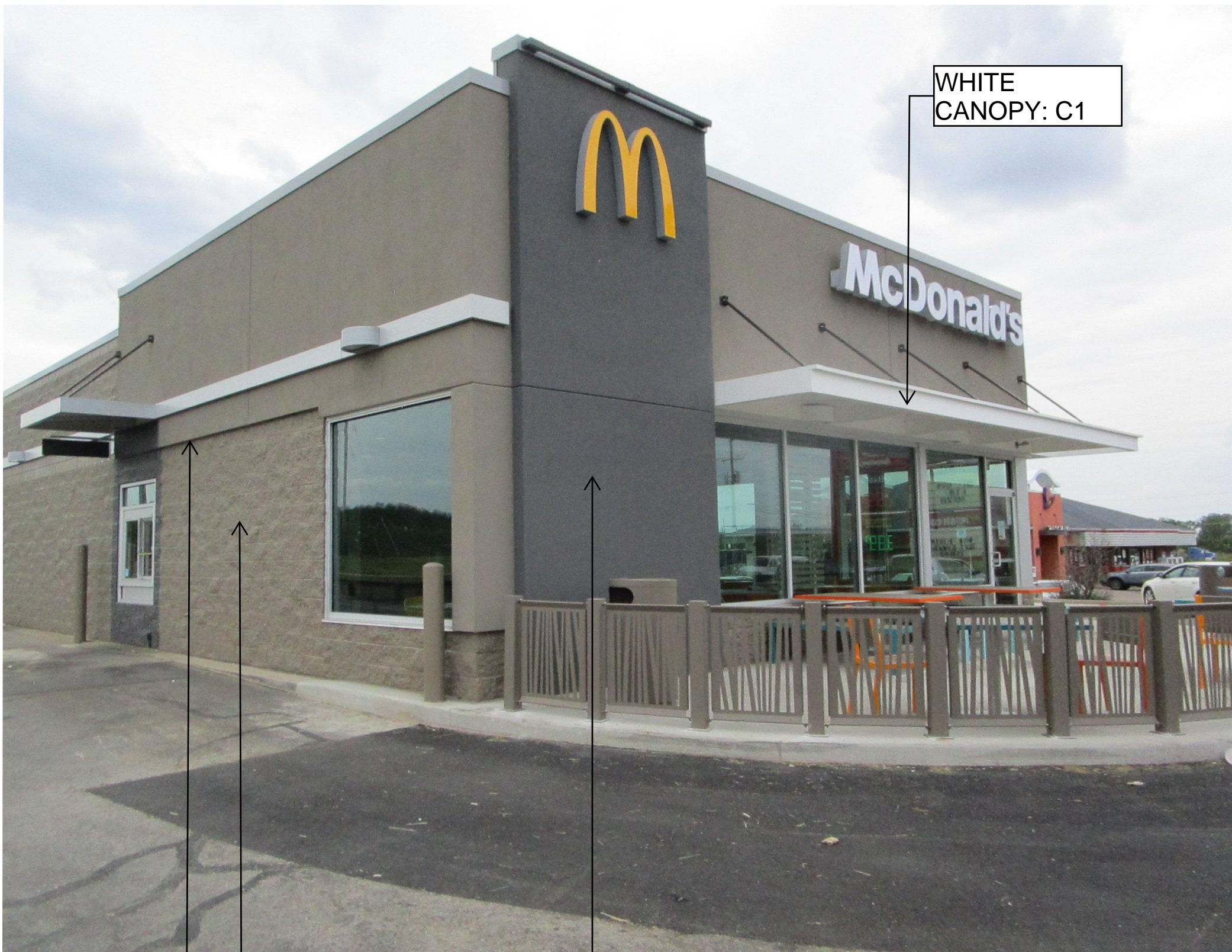
WHITE CANOPY: C1