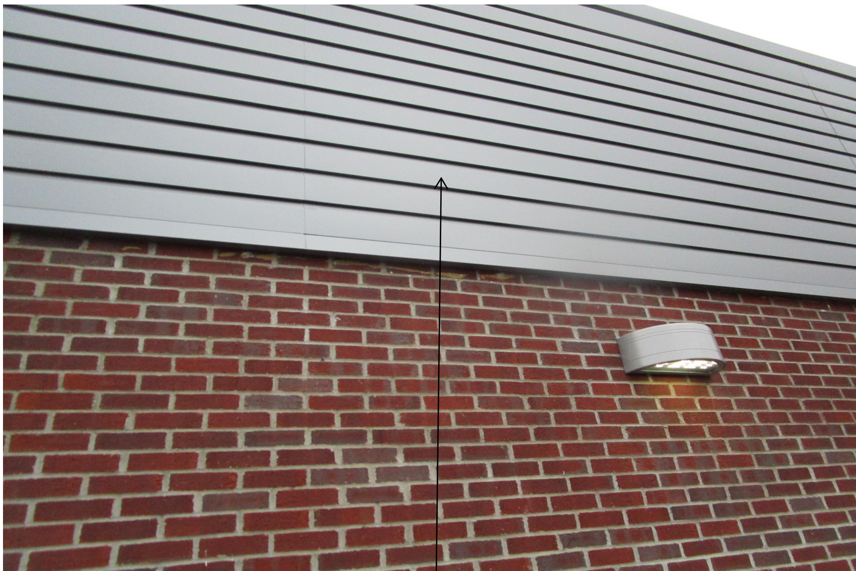
METAL SIDING: MS