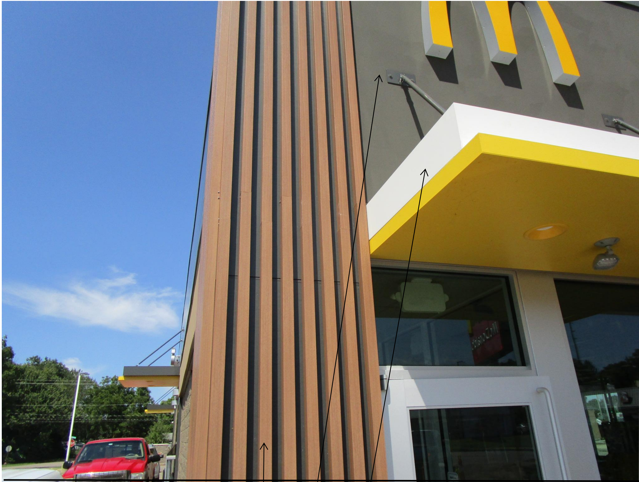
ALUM. BATTENS (WOOD GRAIN): AL