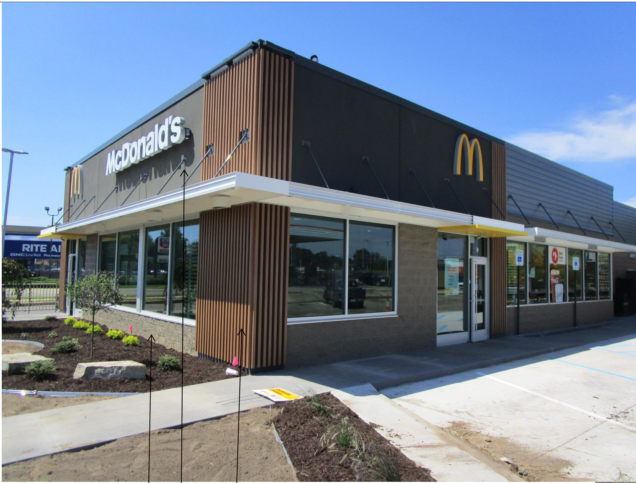
ALUM. BATTENS (WOOD GRAIN): AL