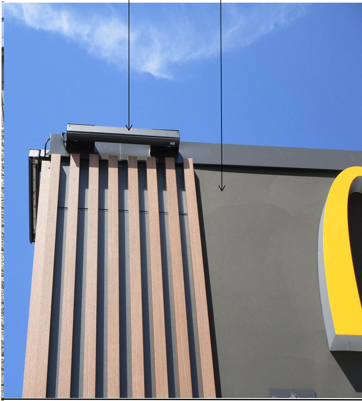
LED ACCENT LIGHTS: LE-L1