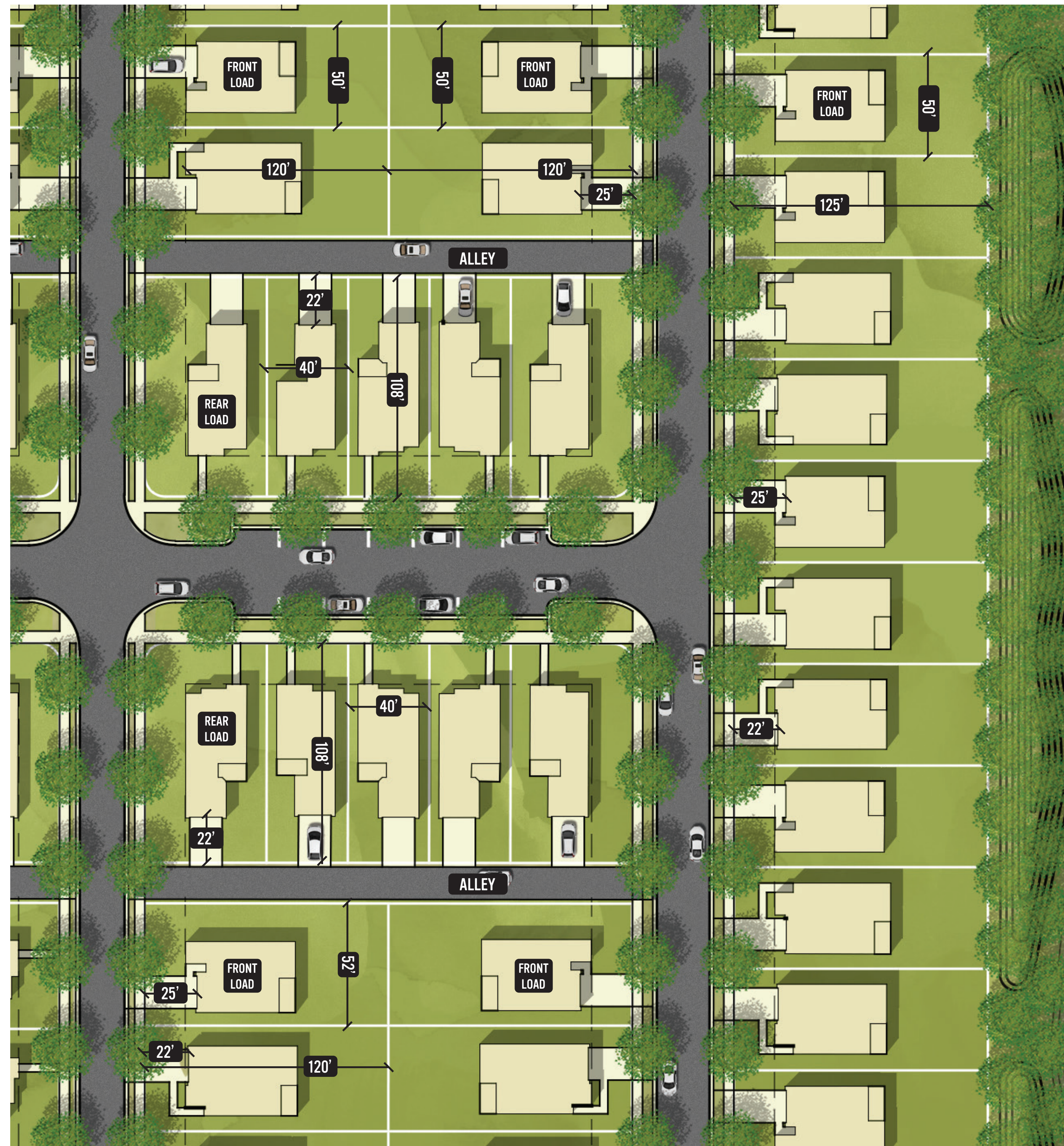
AREA B HOUSING ENLARGEMENT