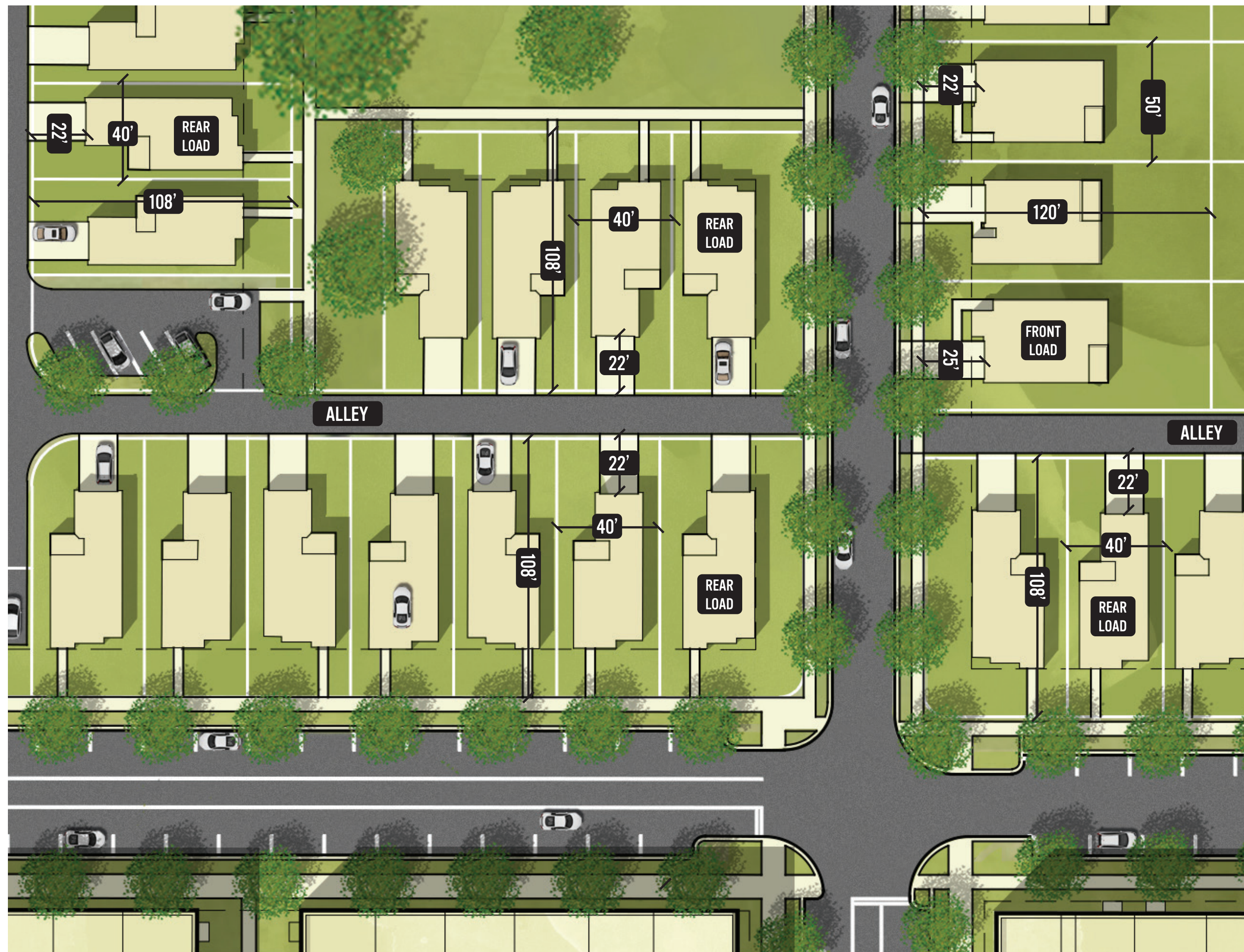
AREA A HOUSING ENLARGEMENT