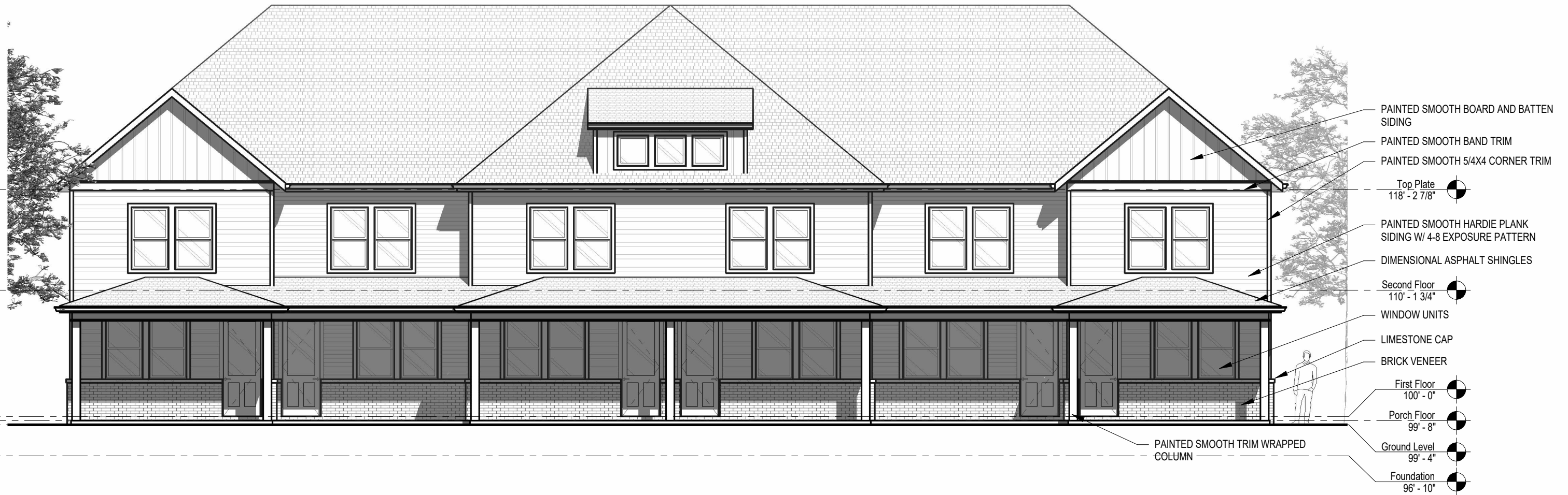
Building Elevation 1 Front/West 1/8" = 1'-0"