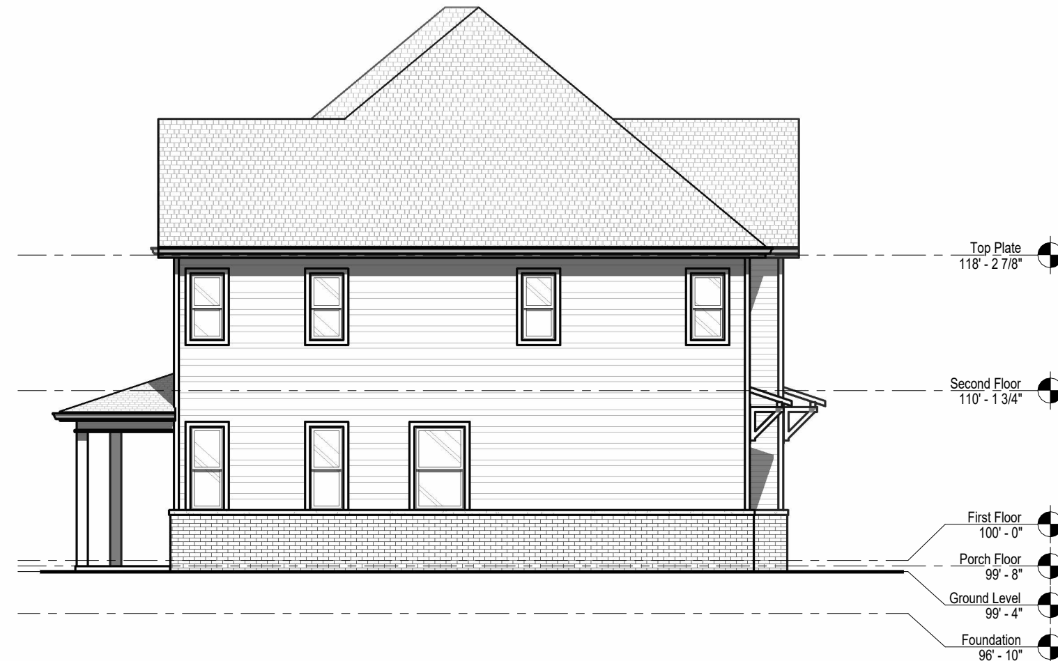
Building Elevation 1 South 1/8" = 1'-0"