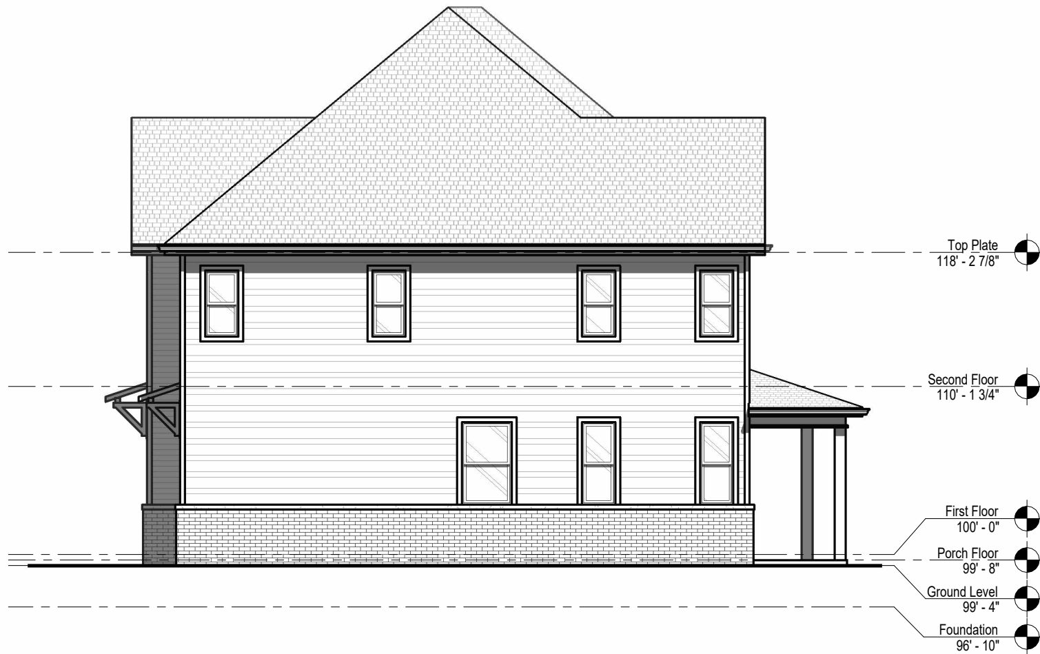
Building Elevation 2 North 1/8" = 1'-0"