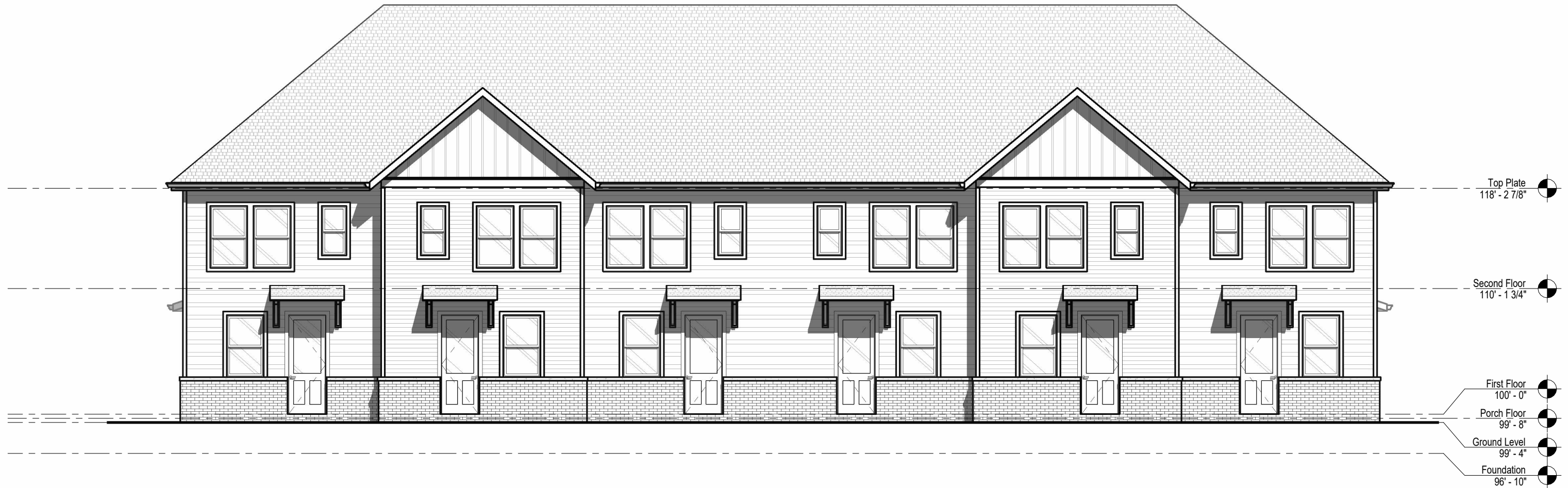
Building Elevation 1 Rear 1/8" = 1'-0"