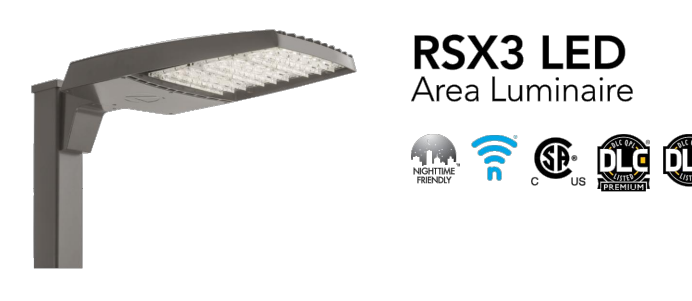
RSX3 LED Area Luminaire

Specifications EPA: 0.70 ft 2 (0.07 m 2 ) Length: 33.8" (85.9 cm) Width: 16.1" (40.9 cm) Height: 3.0" (7.6 cm) Main Body Weight: 48.0 lbs (21.8 kg)