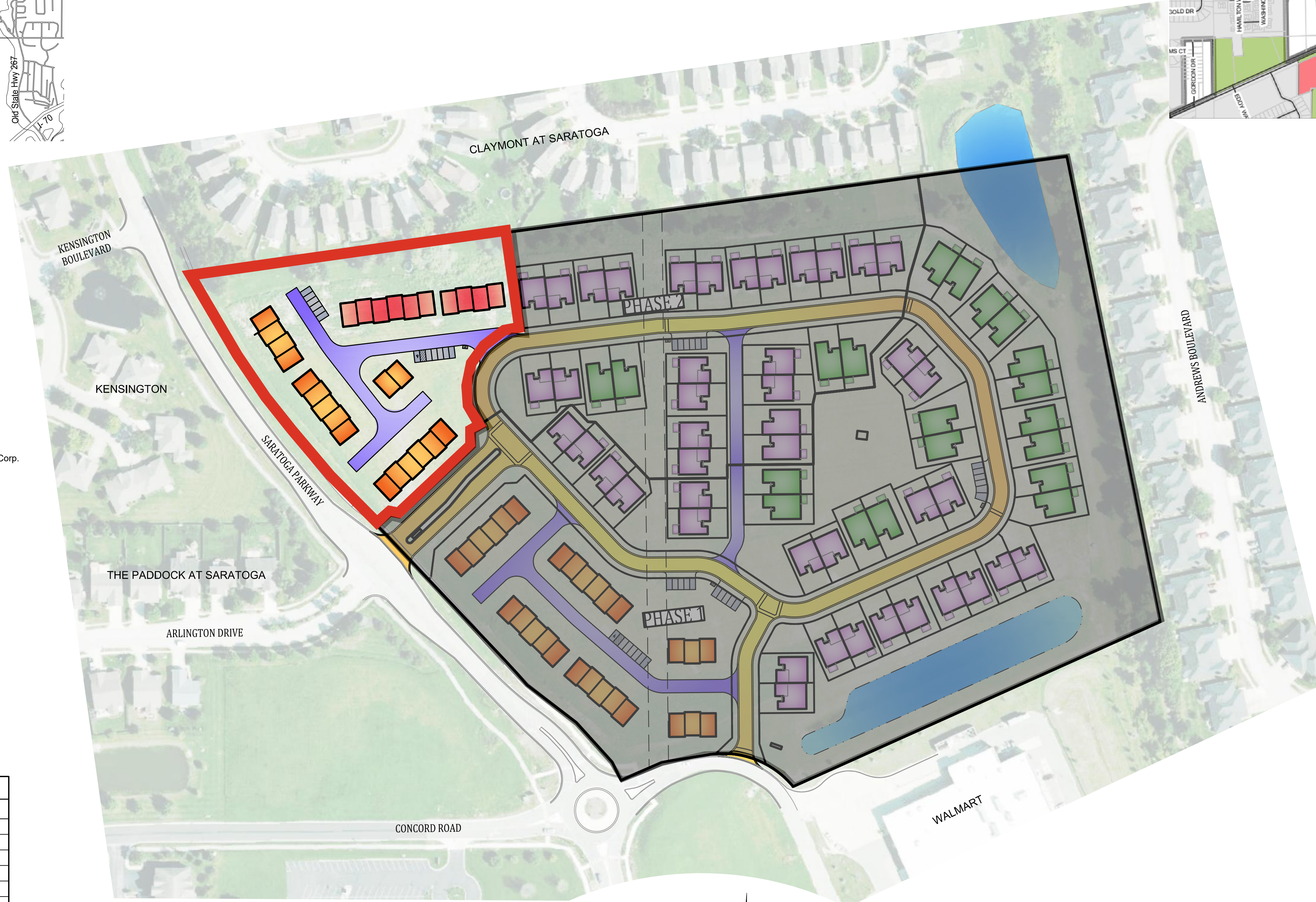
SITE MAP SCALE: 1"=100'

HP PIPELINE: CENTERPOINT ENERGY 1800 WEST 28TH STREET MUNCIE, INDIANA 47302 ANDREW REICHLER ANDREW.REICHLER@CENTERPOINTENERGY.COM o: 765-287-2102; c: 765-215-7040