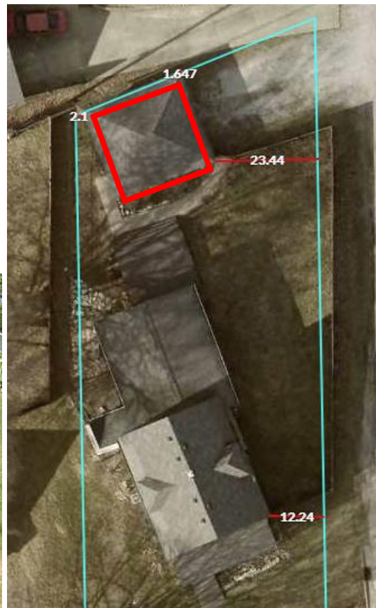
Existing Garage Setbacks

SETBACK. That distance measured perpendicularly from the property line to the closest point of the building, structure, sign structure, parking area or any other permanent improvement.