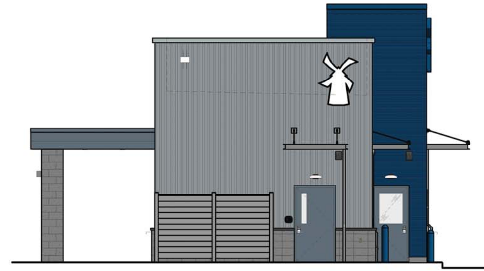
3 REAR ELEVATION 1/4" = 1'-0"