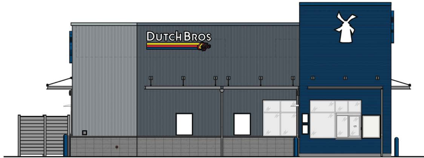
4 LEFT ELEVATION - DRIVE-THRU WINDOW 1/4" = 1'-0"