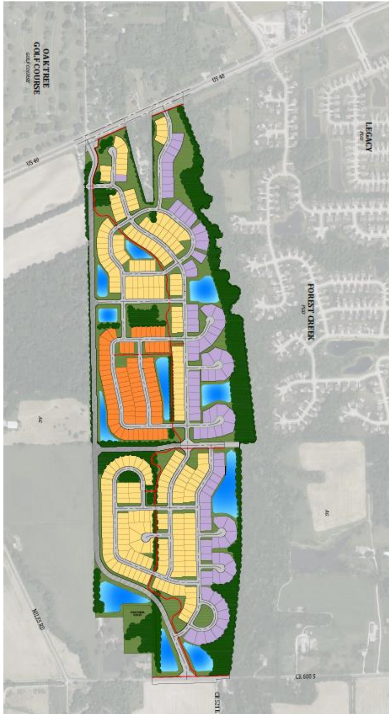
Exhibit A Preliminary Concept Plan