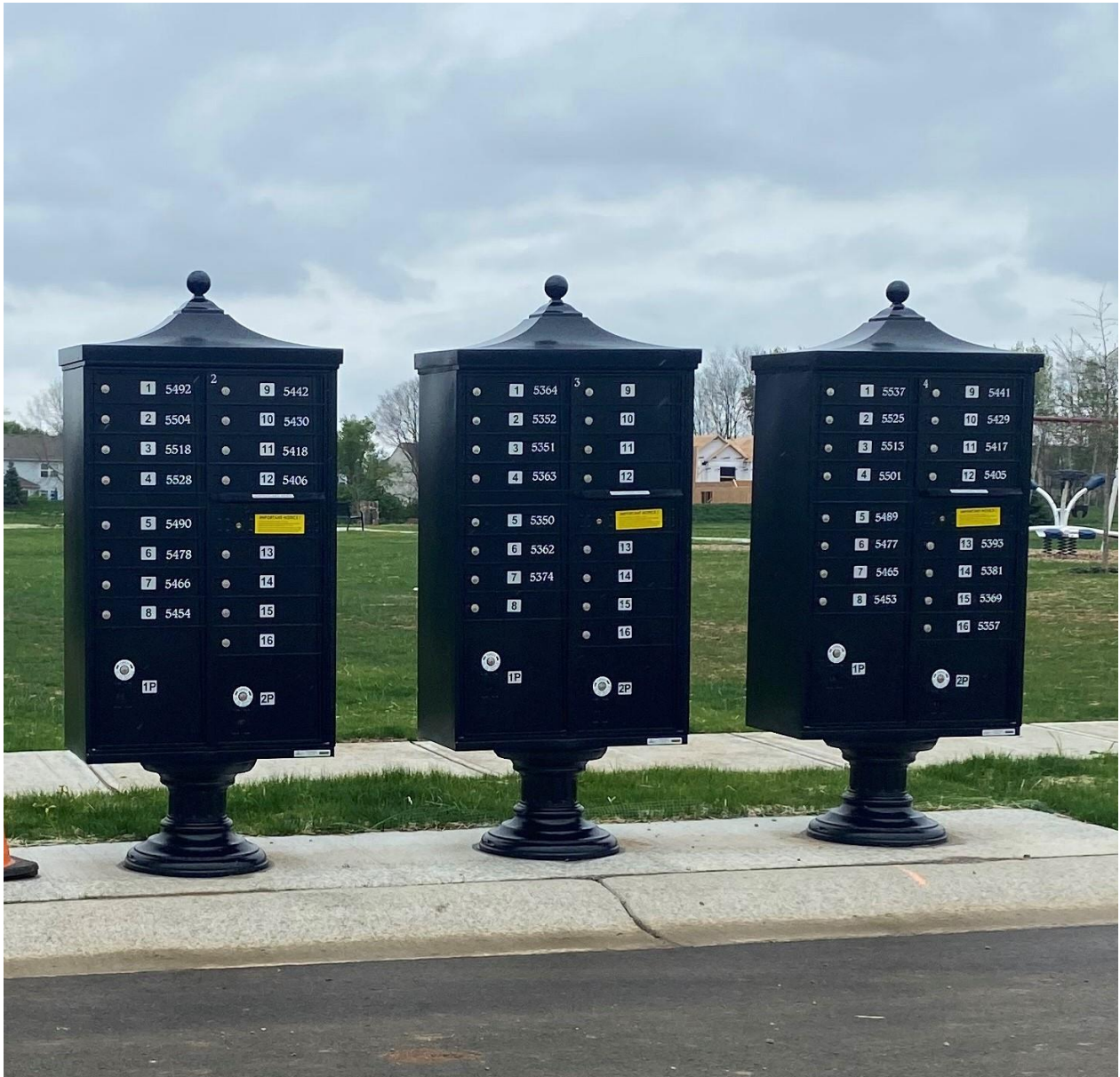
Exhibit D Cluster Mailbox Examples