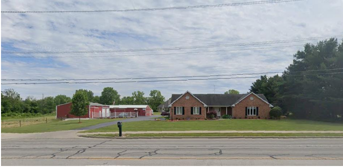
Streetview image (2019)