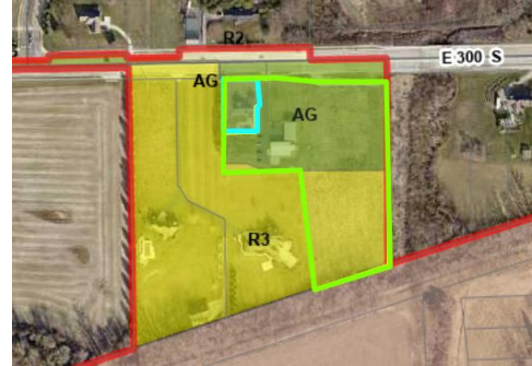
Boundaries of Lot 3 of the Cimmaron Subdivision (green) and the proposed rezone area (teal)