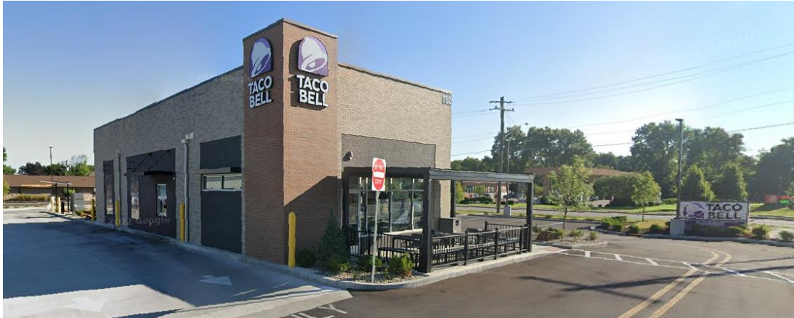
Taco Bell at Vestal Rd. and Main St.