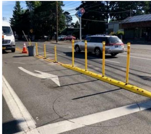
Exhibit 1: Example of Centerline Left-turn Lane Hardening

I agree that the expanded recommendations represent an improvement from the previous plan submission. However, I do have continued concerns about the exit drive proximity to an existing intersection coupled with the proposed increased use of nearly 200 vehicles using that drive during the daily peak hour as a result of this development plan request.