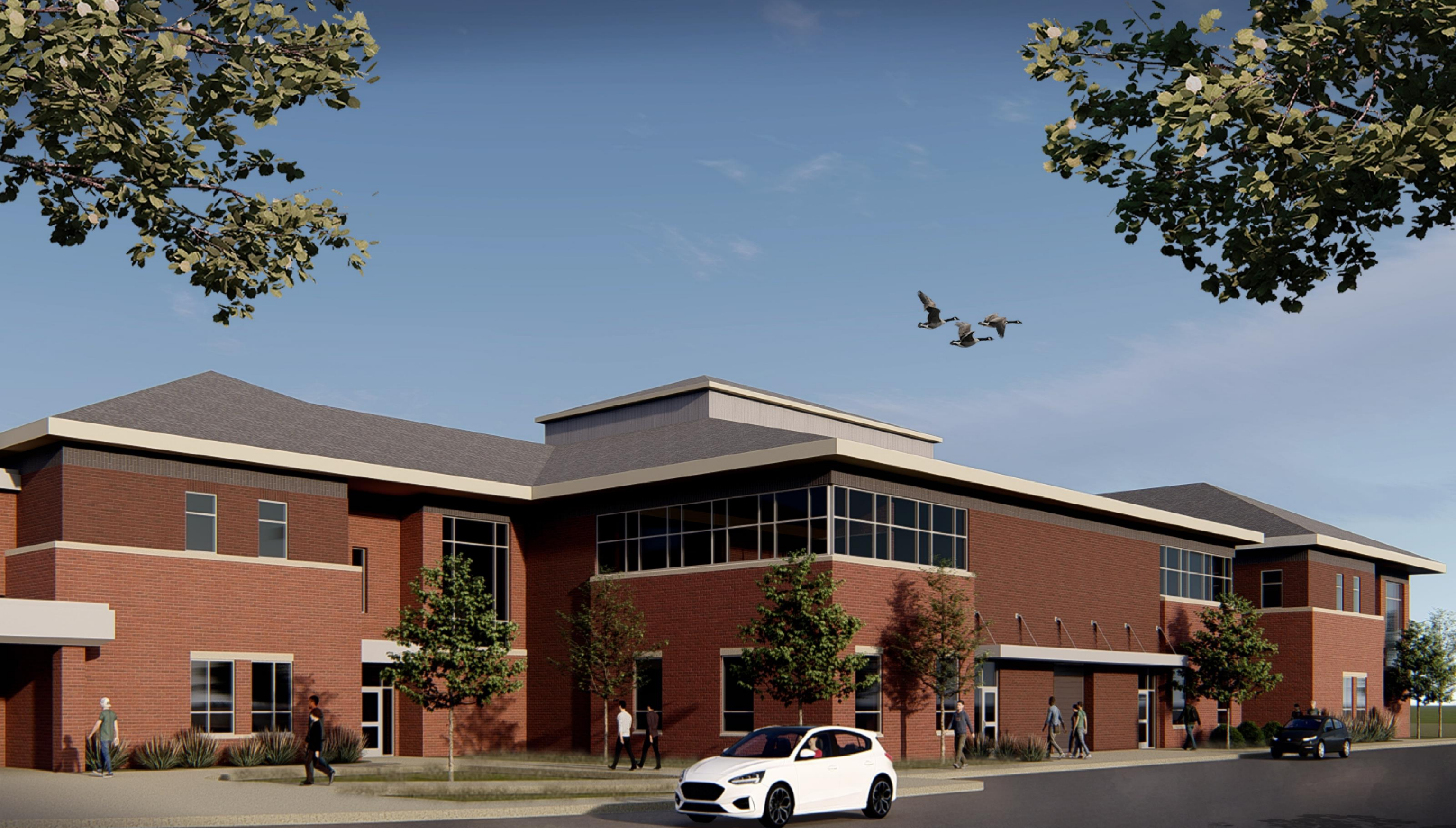
PLTW/Science Expansion (Between G & H Wings)