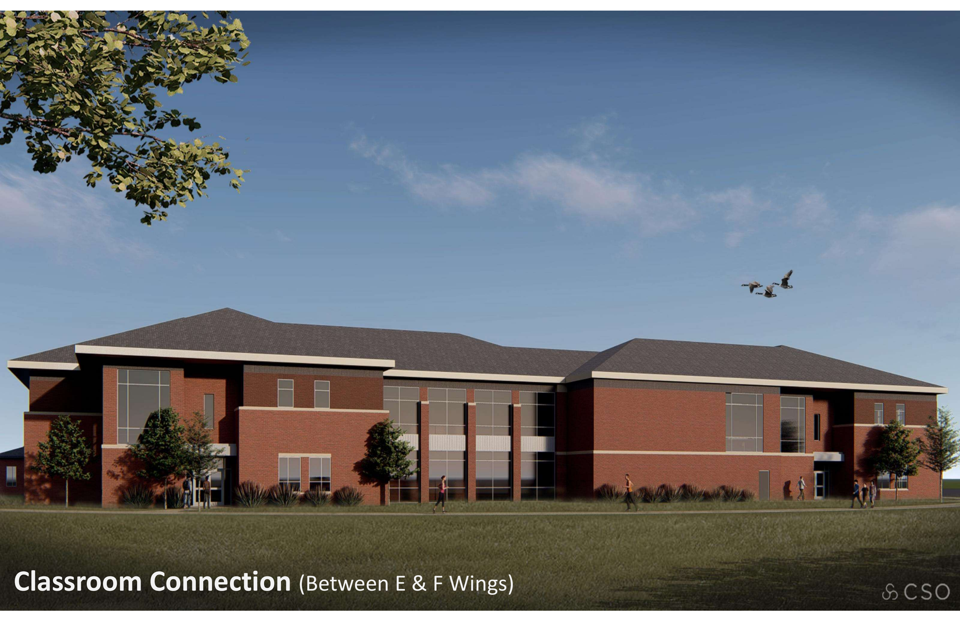
Classroom Connection (Between E & F Wings)