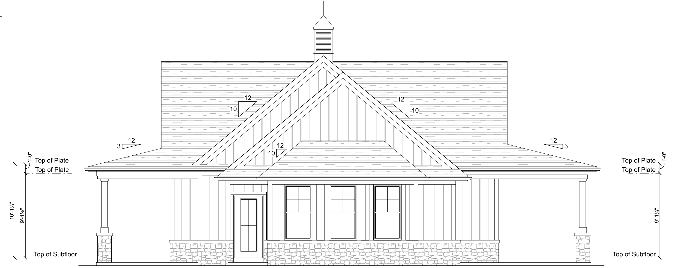
RIGHT ELEVATION SCALE: 3/16" = 1'-0"