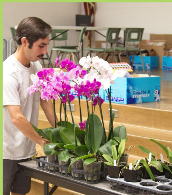
This was the Society's first in-person meeting since March 2020. The food, companionship and program were enjoyed by all. Everyone went home with something.