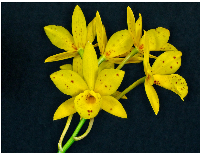
Award No 2022-65 Cdh. Hidden Gold 'Spots' CDC HOS (81.2 Pts.) Owner: Nuuanu Orchids