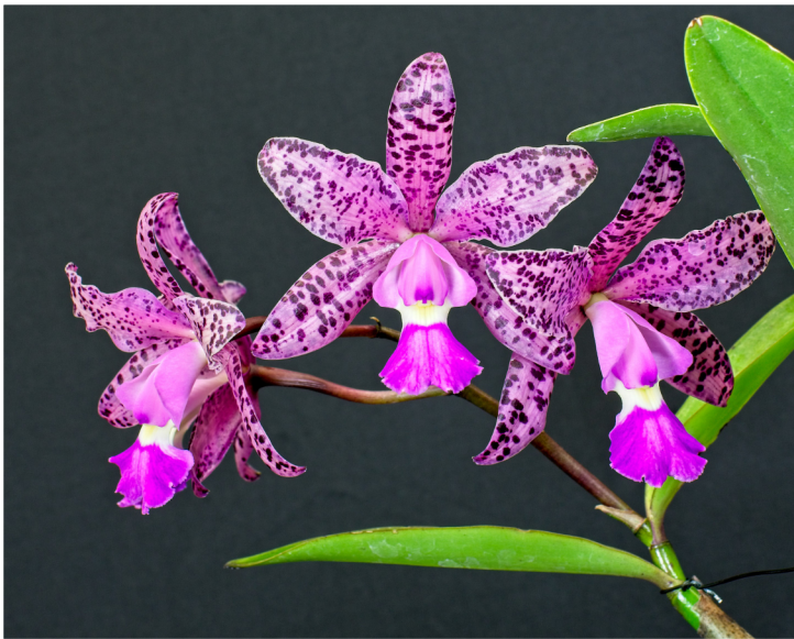
Honolulu Orchid Society Merit Awards Judged at Lanakila Senior Center September 10, 2022

There will be no judging on Saturday, October 8, 2022 at the Lanakila Senior Center. The judging session will instead be held on Thursday, October 6, 2022 at the Honolulu Orchid Society's 2022 Annual Orchid Show at the Washington Middle School Cafeteria. All orchid plants in the displays (floor displays, table top displays and individual displays) will be eligible for merit awards and for trophy judging.