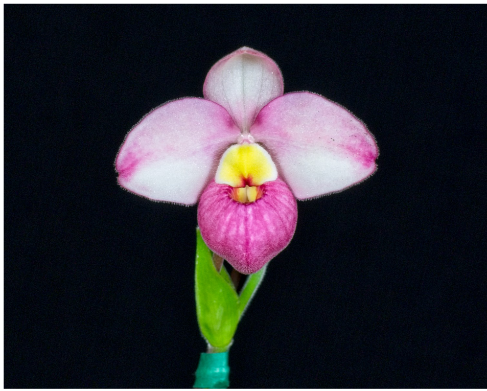
Phragmepidium (Phrag.) Acker's Rose River 'Half Moon' AM HOS (80.5 Pts.) Owner: Nuuanu Orchids