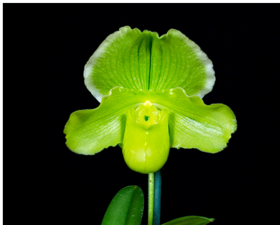
Paphiopedilum (Irish Forest x Hsinying Gold) 'Nuuanu Orchids' AM HOS (83.3 Pts.)

Owner: Nuuanu Orchids (Provisional award pending registration of hybrid)