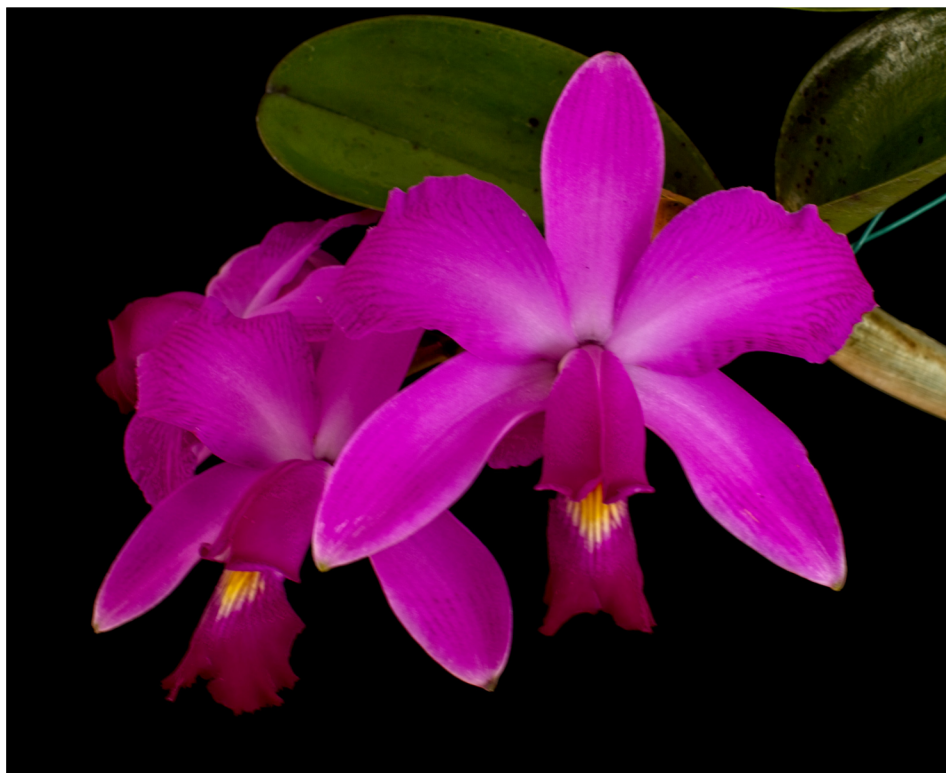
Cattleya (C.) violacea 'Lea' AM HOS (80.3 Pts.)