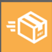
Cloud Data Storage