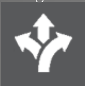
Sales Triggers & Automation