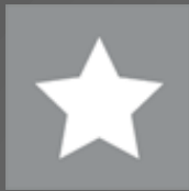
Games & Contests