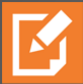
Registration & Waivers