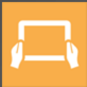
Tablets & Mobile