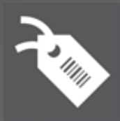
RFID & Scanners