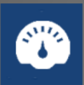
Dashboards & Analytics