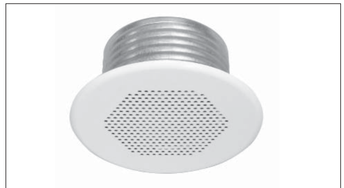
Perforated Cover Plate

LL and RFC49 LL sprinklers discharge water in a hemispherical pattern below the sprinkler deflector. Residential distribution patterns are higher and generally contain a finer droplet size than standard sprinkler patterns. The combination of speed of operation and high discharge pattern required for residential sprinklers has demonstrated, in fire testing, an ability for controlling residential fires, and thereby providing significant evacuation time for occupants. The RFC30 LL, RFC43 LL and RFC49 LL Sprinklers provide the best form of fire protection by combining an attractive appearance and 1/2" (13mm) of cover adjustment for ease of installation. The small diameter cover plate is easily and positively attached and blends into the ceiling, concealing the most dependable fire protection available, an automatic sprinkler system. The RFC30 LL, RFC43 LL and RFC49 LL are cULus Listed for Safety to ANSI/UL1626 and Health Effects to ANSI/NSF Standard 61, Annex G. The cover plate adjustability of the RFC30 LL, RFC43 LL and RFC49 LL can reduce the need for precise cutting of drop nipples. The threaded cover plate assembly can be adjusted without tools to fit accurately against the ceiling. The fire protection system need not be shut down to adjust or remove the cover plate assembly.