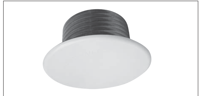
Plain Cover Plate

Model RFC30 LL, RFC43 LL and RFC49 LL Concealed Residential Sprinklers are fast response residential fusible solder link automatic sprinklers. Residential sprinklers differ from standard sprinklers primarily in their response time and water distribution patterns. Model RFC30 LL, RFC43