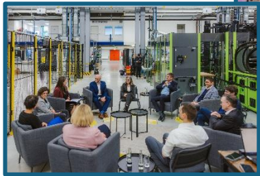
Round Table „Future & Digitalization“