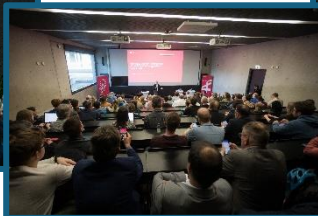
Impact Day, Augsburg University of Applied Sciences