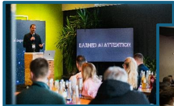
Workshops & Keynotes