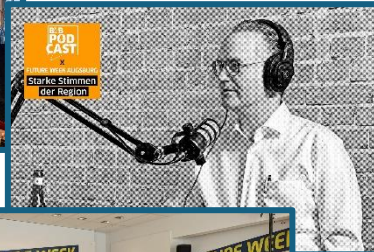
FUTURE WEEK Podcast