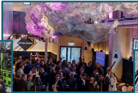
Digital Dinner Network Event