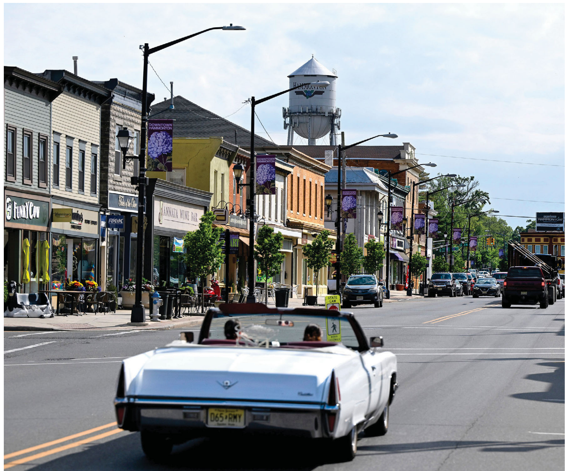
A vintage car cruises the main strip of Hammonton, above. Opposite page: Hammonton is the self-proclaimed blueberry capital of the world, but it has a lot more going for it than fruit.