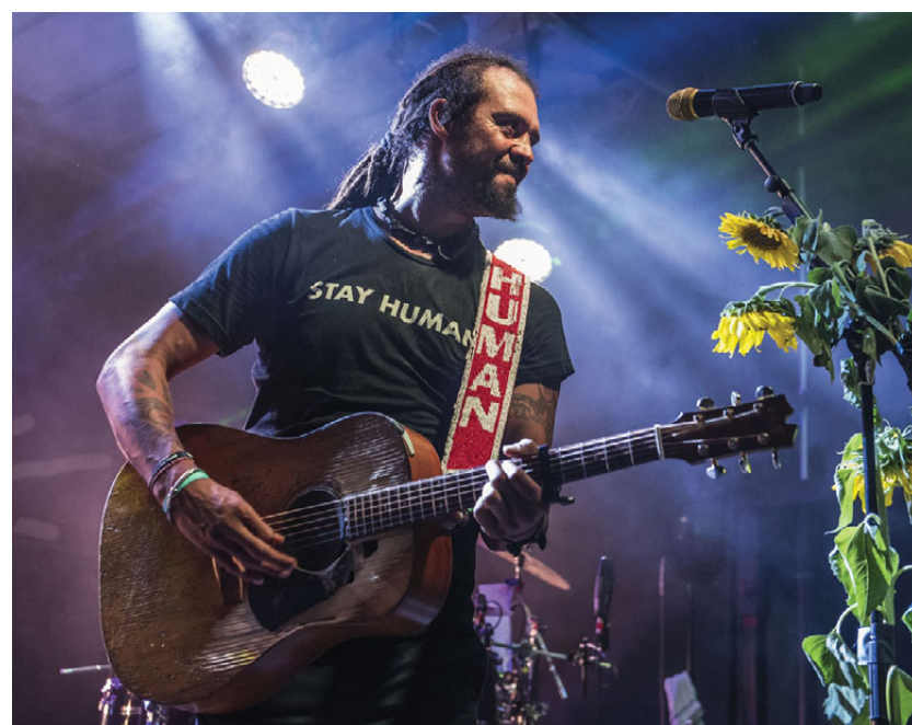
Michael Franti & Spearhead bring their live show to Ocean's Ovation Hall on July 18.

For tickets and information about accommodations: barefootcountryfest.com .