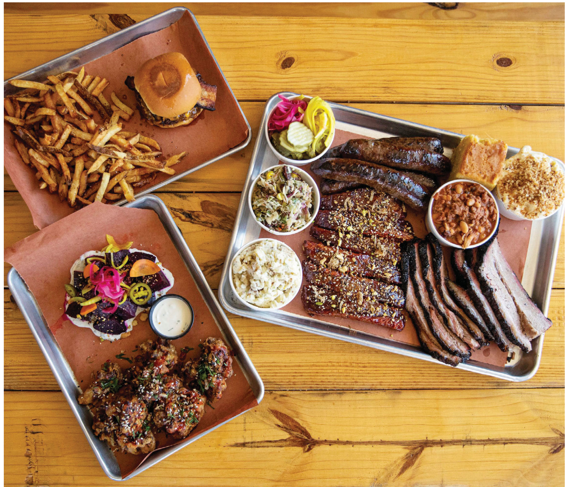
Find smoky smash burgers, ribs, brisket, and sides at Wildwoods BBQ, above. Opposite page: Fresh-seared tuna at Clemmy's in Waretown.