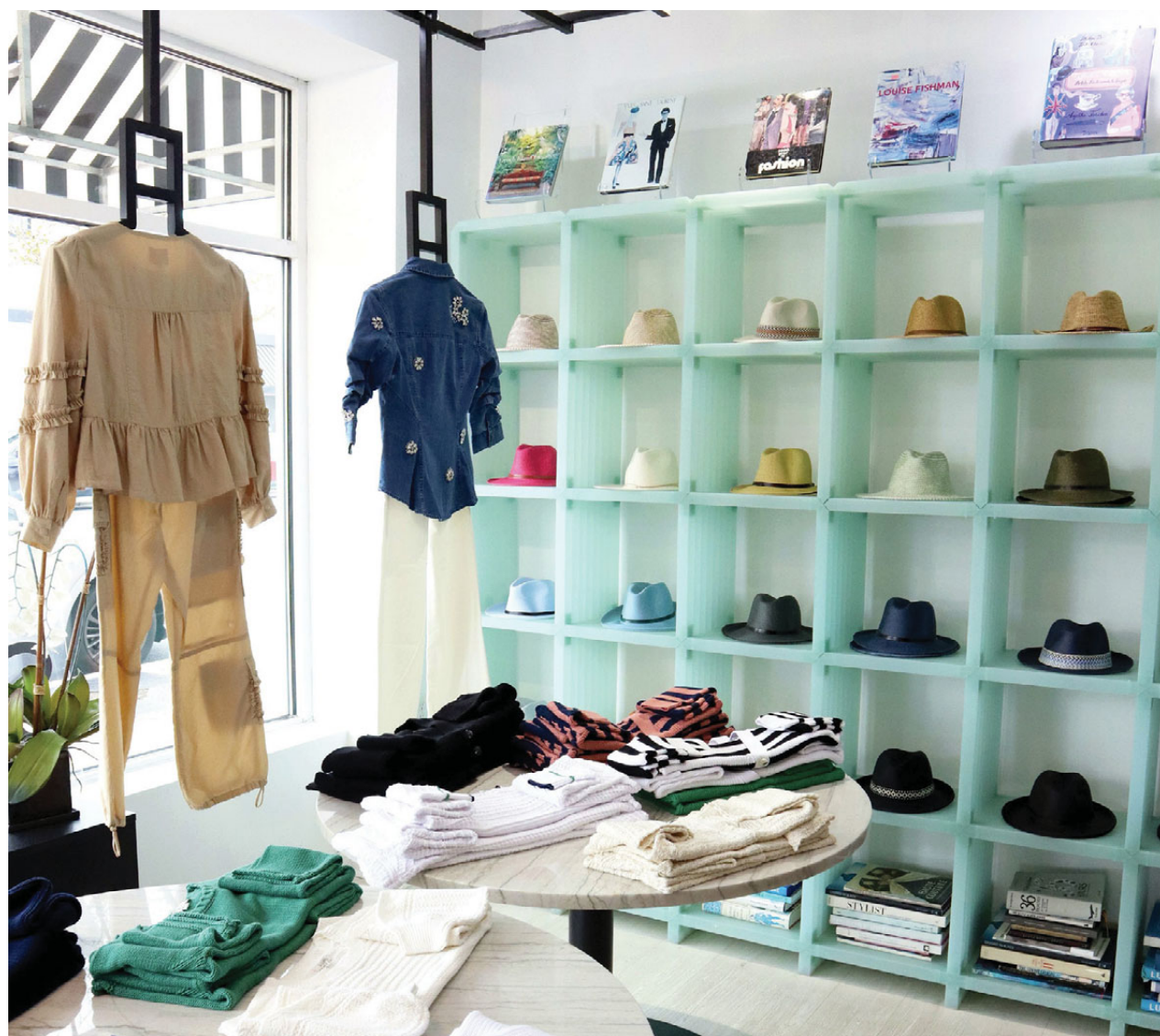
Fashion guru Ann Gitter's Knit Wit stocks in-demand blazers, bags, and dresses in a 3,000-square-foot showroom in Margate.

215 DECATUR ST., CAPE MAY; 609-827-1159; INSTAGRAM.COM/WILLOWANDSTONE_CM