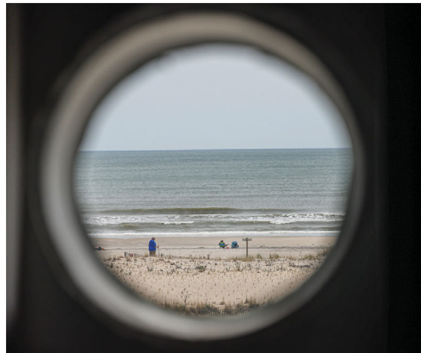
A view looking out to the ocean from Lucy's right eye.

illustrates this elephant has sass. I like sass.