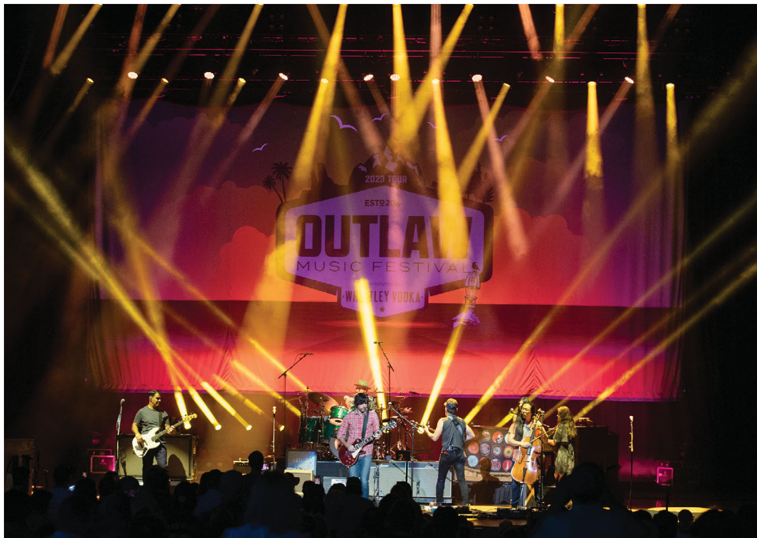
The Avett Brothers are scheduled to play at the Hard Rock in Atlantic City on Aug. 9.