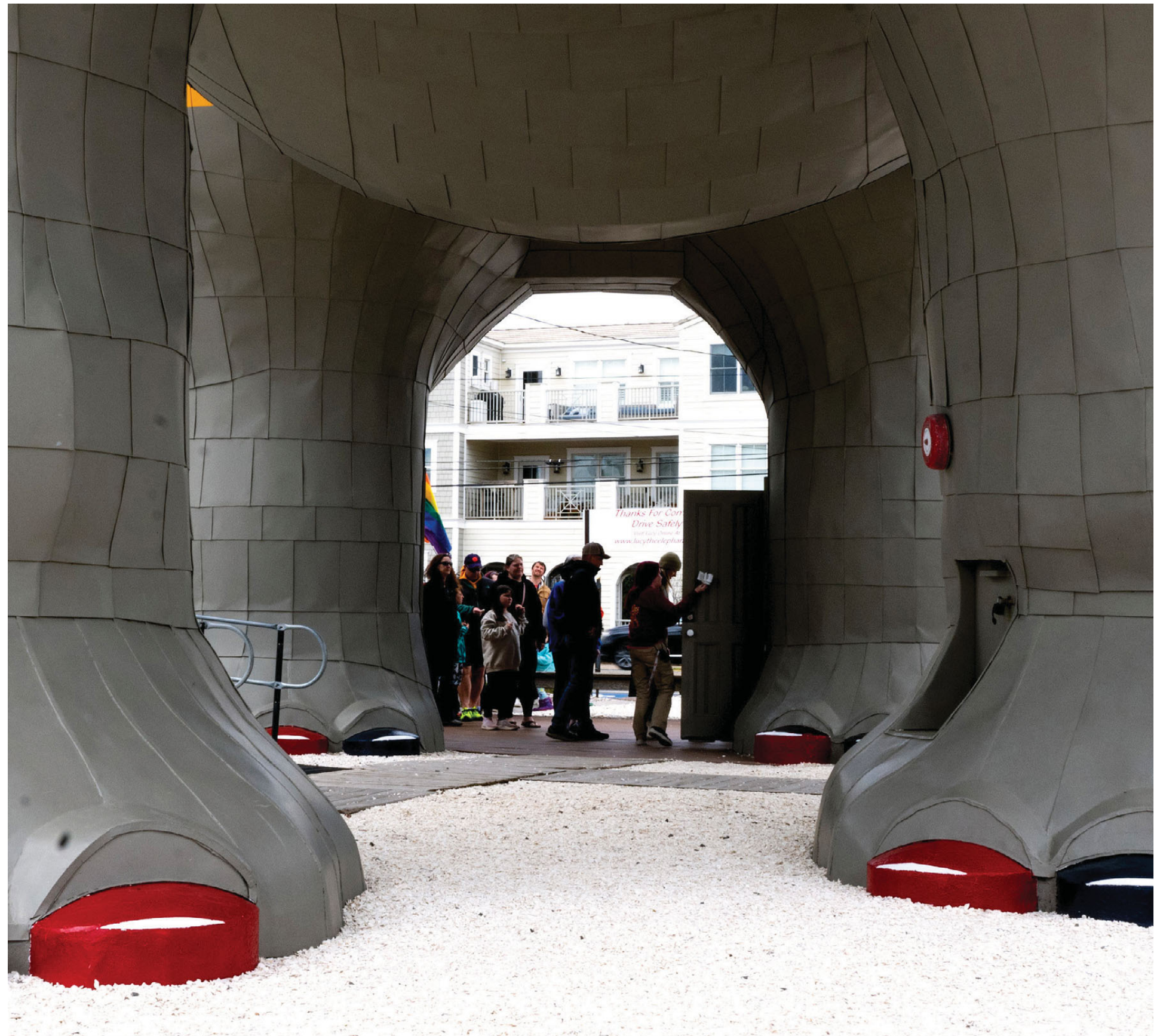
Built in 1881 as a real estate office, Lucy the Elephant still brings smiles after many storms, including two direct lightning strikes.