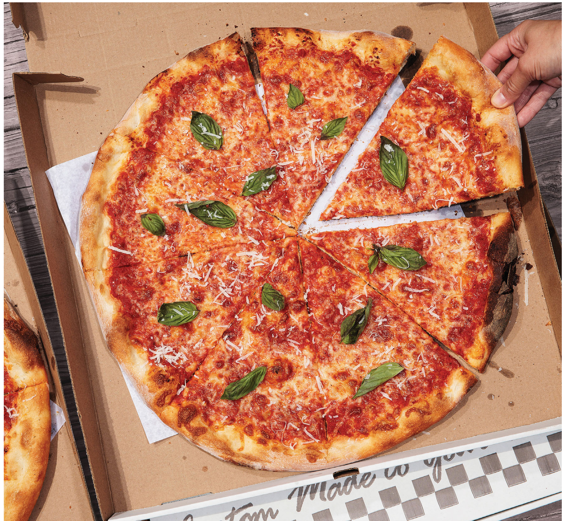
Above: The Margherita pie at Bakeria 1010 in Ocean City starts with a sourdough crust. Previous page: Enjoying Zio Niccolo Pizza on the beach.