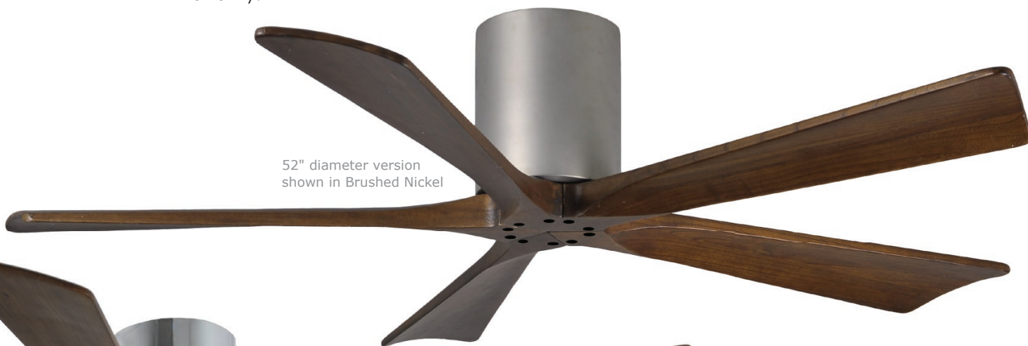
52" diameter version shown in Brushed Nickel

Cutting a figure like no other, the Irene-5H ceiling-mount fan, is rustic, yet strikingly modern with five neatly joined, solid wood walnut or barn wood tone blades. A cylindrical motor housing complements its minimal profile. Irene-5H is streamline while still appearing warm and natural. Constructed of cast aluminum and heavy stamped steel, the Irene-5H has a limited lifetime warranty.