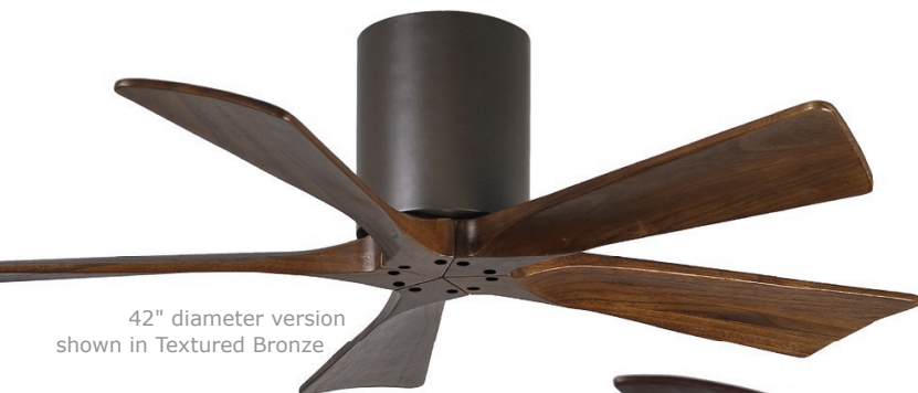
42" diameter version shown in Textured Bronze