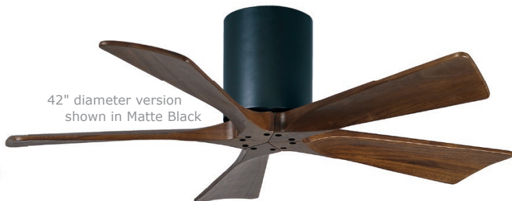
42" diameter version shown in Matte Black