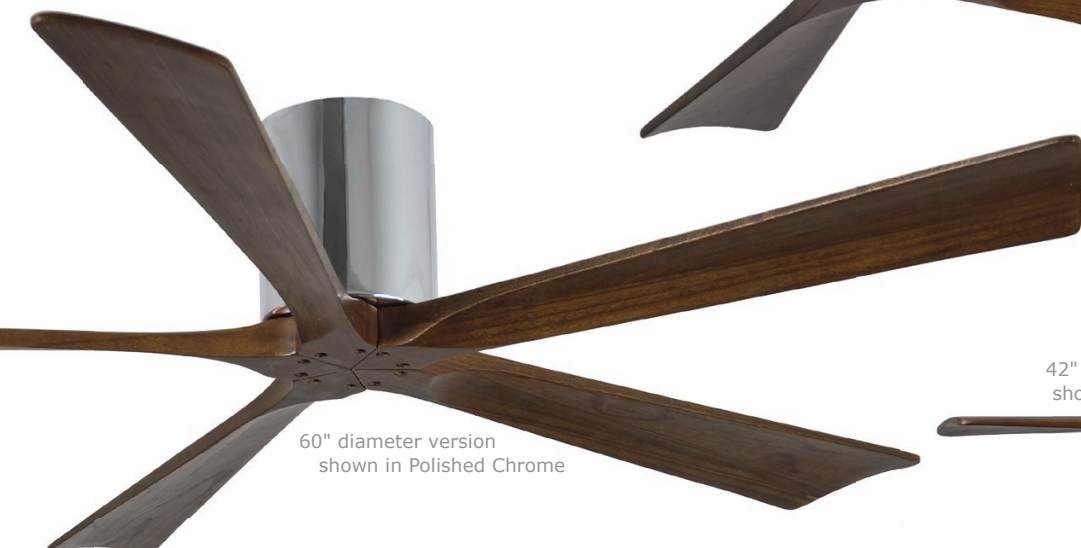
60" diameter version shown in Polished Chrome