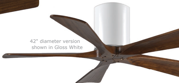
42" diameter version shown in Gloss White