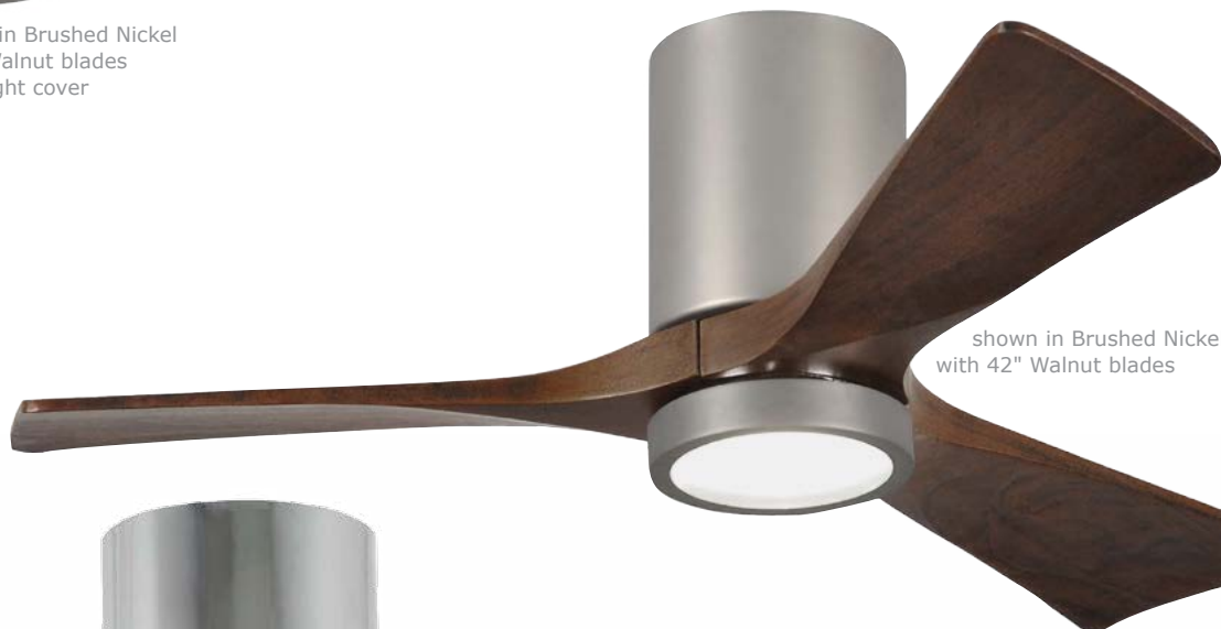
shown in Brushed Nickel with 42" Walnut blades