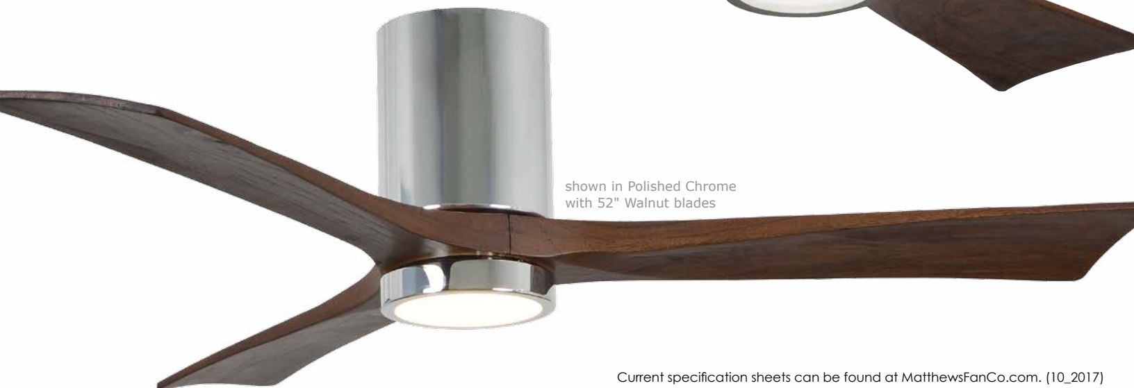
shown in Polished Chrome with 52" Walnut blades