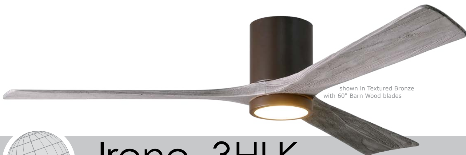
shown in Textured Bronze with 60" Barn Wood blades