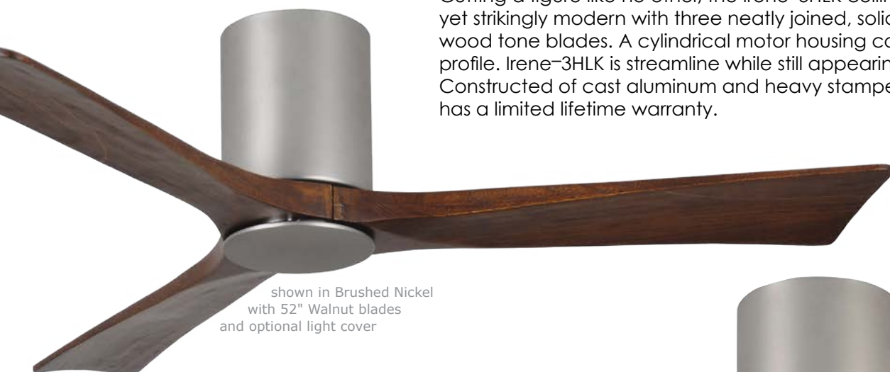
shown in Brushed Nickel with 52" Walnut blades and optional light cover

Cutting a figure like no other, the Irene-3HLK ceiling-mount fan, is rustic, yet strikingly modern with three neatly joined, solid wood walnut or barn wood tone blades. A cylindrical motor housing complements its minimal profile. Irene-3HLK is streamline while still appearing warm and natural. Constructed of cast aluminum and heavy stamped steel, the Irene-3HLK has a limited lifetime warranty.