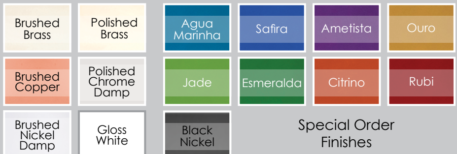
Special Order Finishes