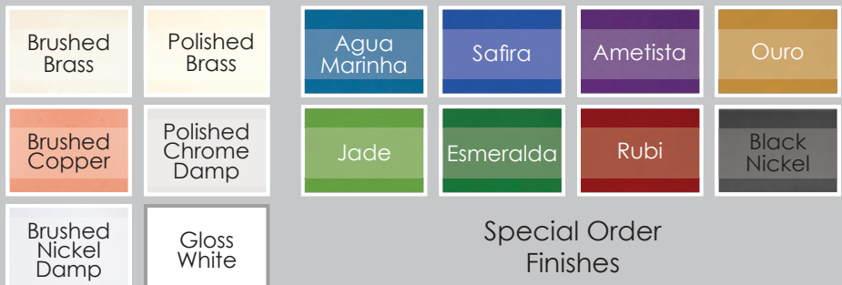
Special Order Finishes