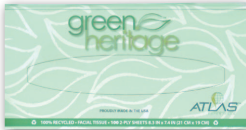
#030A / #072A

Atlas Green Heritage® facial tissue is a soft-feeling, premium quality boxed facial tissue. Sheet size: 8.2" x 7.4", 100 sheets per box.