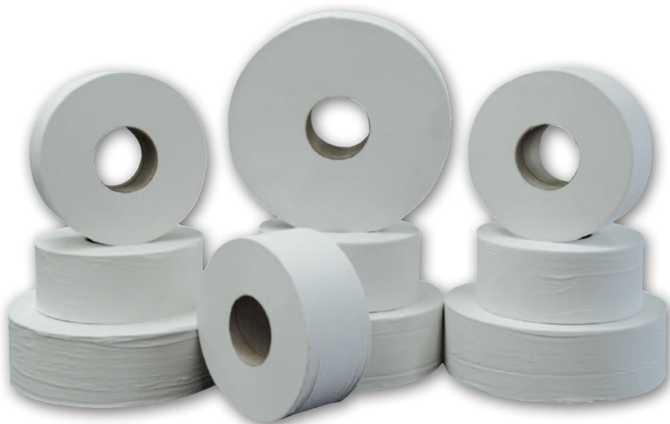
#700 / #800

Jumbo roll tissue is safe for all septic systems. Universal 3.35" core. Green Heritage® Green Seal™ tissue products are made from 100% recycled fiber and bear the ultimate mark of environmental responsibility certifying that these products meet the Green Seal environmental standards for tissue products.