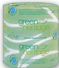
#115 - #125

Atlas Green Heritage® 1-Ply tissue is white, soft, absorbent, overall embossed and individually wrapped. Safe for all septic systems. Atlas Green Heritage Green Seal™ tissue products are made from 100% recycled fiber and bear the ultimate mark of environmental responsibility certifying that these products meet the Green Seal environmental standards for tissue products.