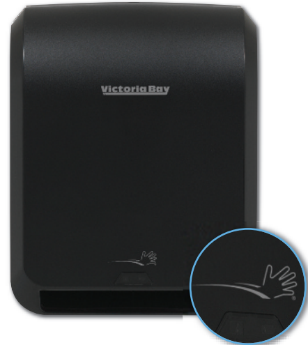
346357 VICTORIA BAY AUTOMATED PAPER ROLL TOWEL DISPENSER 12.9"x9"x16"

Easy to Maintain: High-capacity 1150-ft towel rolls last longer, requiring less maintenance and minimizing refill frequency.