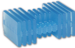
348254 AUTOMATED IN-STALL FRESHENER DISPENSER REFILL COASTAL BREEZE • 12/CASE

Anti-theft: Key and lock provides ample security to help reduce the risk of vandalism or theft.