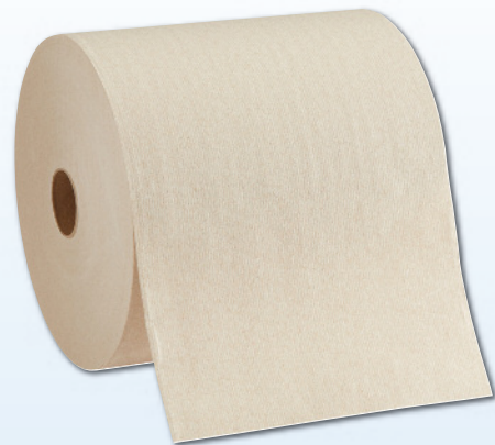
346359 VICTORIA BAY 8" RECYCLED PAPER TOWEL ROLL BROWN • 1150 FT/ROLL • 6 ROLLS/CASE

Affordable Quality: One-at-a-time dispensing helps prevent waste and helps prevent germ transmission.