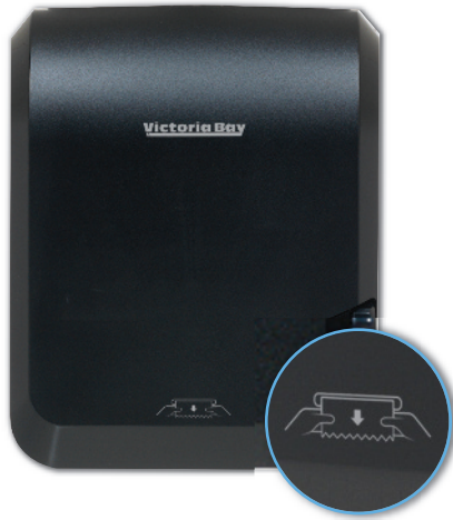
346356 VICTORIA BAY MECHANICAL PAPER ROLL TOWEL DISPENSER 12.9"x9"x16"