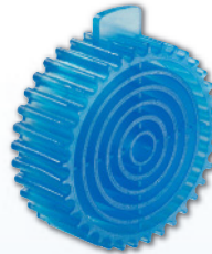
348253 POWERED WHOLE-ROOM FRESHENER DISPENSER REFILL COASTAL BREEZE • 12/CASE

Easy to Maintain: Simple installation and easy access design makes maintenance a breeze.