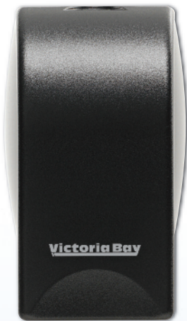
348252 VICTORIA BAY POWERED WHOLE-ROOM FRESHENER DISPENSER 4.1"x3.6"x6.8"

VOC Compliant: Compliant for VOC content with applicable federal and state regulations.